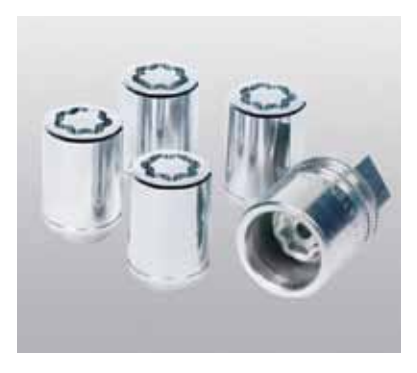
Wheel Lock Nuts. Help protect your valuable wheels and tires from theft with a set of Hyundai wheel lock nuts.