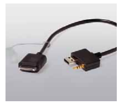
iPod® Cable. This unique cable allows a convenient direct hook-up with your iPod® to your vehicle's stereo system in addition to charging the unit while you are using it.