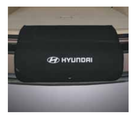
Trunk Lip Protector. Protects the paintwork on your rear bumper from scuffs and scrapes when loading and unloading cargo.

Individual needs call for individual solutions. That's why Hyundai goes out of its way to offer you a line of accessories designed to suit specific demands. Custom-fit your Sonata your way with Hyundai's authorized line of parts and accessories.