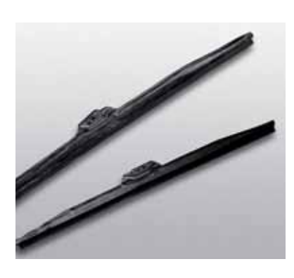
Winter Wiper Blades. Designed for Canadian winters, Hyundai winter wiper blades ensure you see the road ahead.