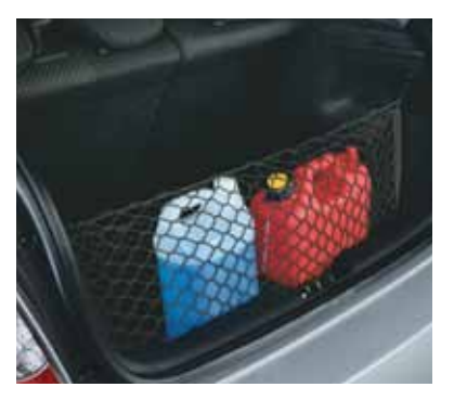
Cargo Net. A custom-fit cargo net ensures everything you're transporting remains organized and in place by preventing items from sliding around.