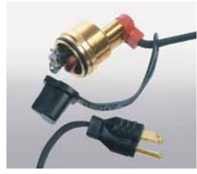
Block Heater. Engineered for your Hyundai, a block heater will help ensure fast starts and reduce engine wear in extreme weather.