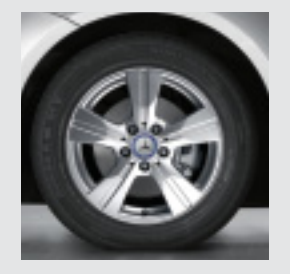
16" 5-spoke alloy wheel

Available as part of the Avantgarde Edition Package on the B 200 TURBO are the 17" 5-twin-spoke alloy wheels. Savvy and stunning, these dramatic additions will impress even the most discerning critics, and conquer any road or weather condition with ease.