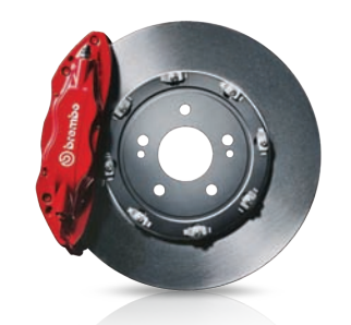
RACING-INSPIRED BREMBO® BRAKES

LIKE ALL BAD BOYS, THE LANCER EVOLUTION MR LIVES HARD AND FAST. EIBACH® SPRINGS AND BILSTEIN® STRUTS ARE THE HIGHLIGHT OF CUTTING EDGE SUSPENSION. THE LANCER EVOLUTION MR'S RACING-INSPIRED BREMBO® BRAKES FEATURE 2-PIECE FRONT ROTORS WITH ALUMINUM HATS. THIS REDUCES UN-SPRUNG AND ROTATING WEIGHT FOR BETTER HANDLING AND PERFORMANCE WITHOUT SACRIFICING BRAKING ABILITY. IN GENERAL, THE ALL-AROUND PURPOSEFUL GOOD LOOKS AND INSTINCTIVE PERFORMANCE PUT THE EVOLUTION INTO A POWER CLASS OF ITS OWN.