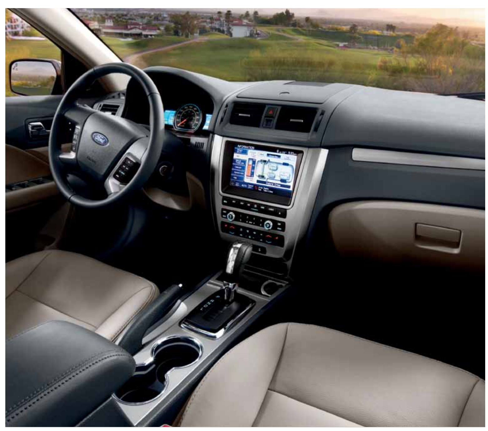
Medium Light Stone leather trim<sup>2</sup> with available equipment. I Medium Light Stone cloth trim. I SmartGauge™ with EcoGuide. I 110-volt power outlet.