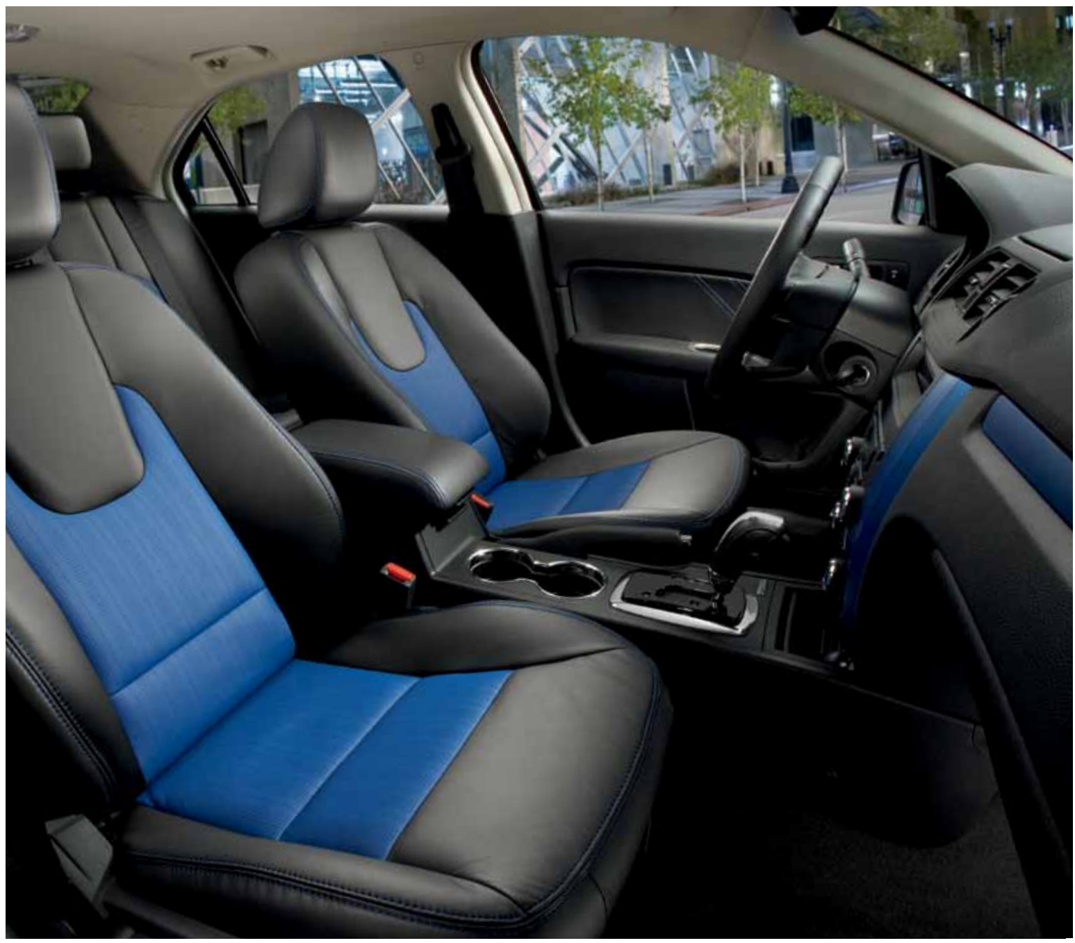
Charcoal Black leather trim. Sport Blue perforated inserts. Charcoal Black leather trim. Charcoal Black perforated inserts. BLIS® with cross-traffic alert. Black-chrome grille.