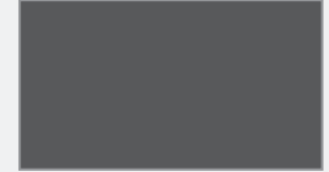
Titanium Grey Metallic