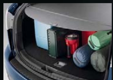
*Accessory retractable cargo cover shown. Please remember to properly secure all cargo.

Large rear doors open up to 72°, creating an extra-wide opening for quick and easy entry and exit. And with a cabin floor flush with the side sills, tripping over high side sills is no longer a danger – unlike some crossovers with sills up to 7.5 cm higher than their floors.