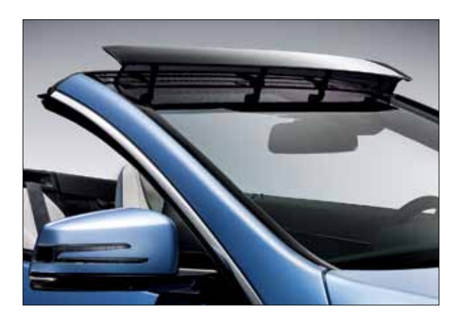
AIRCAP® technology ensures a comfortable draft-free interior.

Open-top driving has never been more refined. The AIRCAP® system combines an extendable, power operated wind deflector mounted atop the windshield frame, with an electronically adjustable draught-stop positioned between the rear head restraints. Meanwhile, AIRCAP® diverts the flow of air over the passenger compartment and delivers a virtually draft-free interior – all at the touch of a button. The ingenious AIRSCARF system¹ extends the open-air driving season is by sending heated air from vents mounted in the head rests to the shoulders and neck areas of the driver and front passenger. Whatever your mood, the E-Class Cabriolet will readily oblige with a fully electric fabric roof that opens and closes automatically. Best of all, these features are easily accessible via the new full-colour display instrument cluster on the centre console.