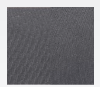
Grey Cloth* With YES Essentials® stain protectant Standard on 3.3L model