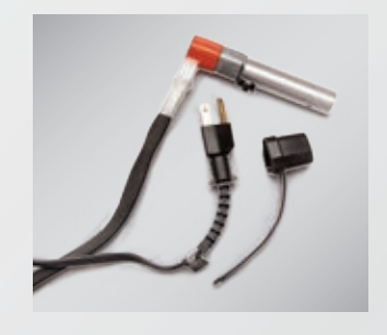
Block Heater. Engineered for your Hyundai, a block heater will help ensure fast starts and reduce engine wear in extreme weather.