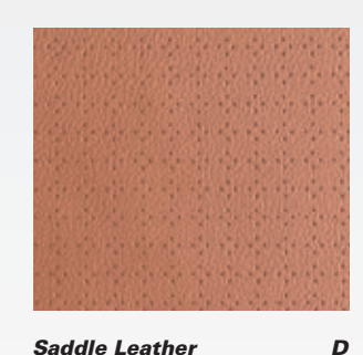
Saddle Leather Available on 3.3L Limited model