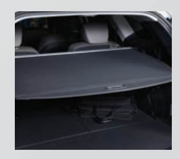
Cargo Cover. Keep your valuables safe and out of sight with an easily removable cargo cover.