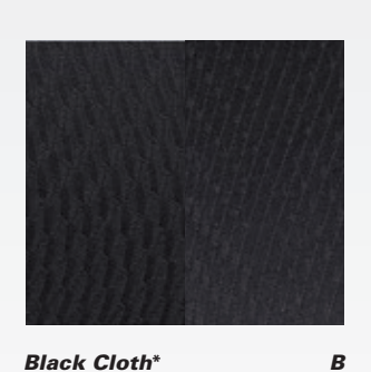
Black Cloth* With YES Essentials® stain protectant Standard on 3.3L Premium model