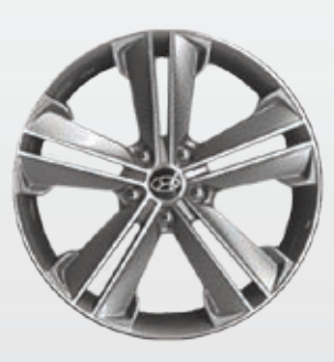
3.3L Limited 19" Wheels

Choice of interior colour depends upon model and exterior colour selection. Due to digital production process, the colours shown throughout this brochure may vary slightly from the actual hue. See your dealer for model applications and to view the Hyundai Colour Selector. Visit hyundaicanada.com or see your dealer for details. *Not exactly as shown.