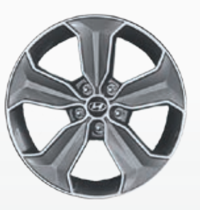
3.3L, 3.3L Premium and 3.3L Luxury 18" Wheels