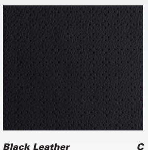
Black Leather Standard on 3.3L Luxury and 3.3L Limited models