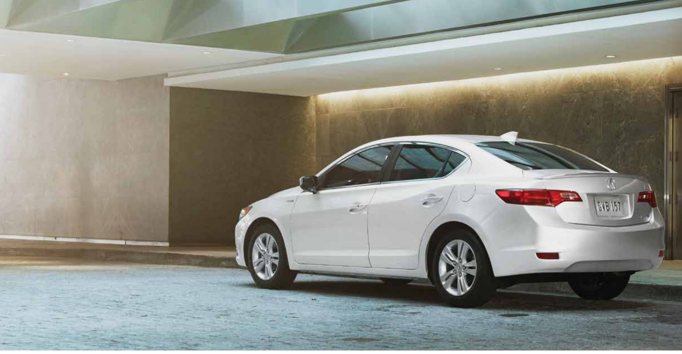
HYBRID Efficiency meets luxury. They embrace.