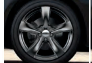
18-INCH HYPER BLACK ALUMINUM Standard on GT