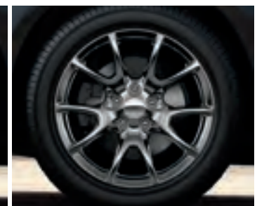
17-INCH HYPER BLACK ALUMINUM Included in Rallye Appearance Group on SXT