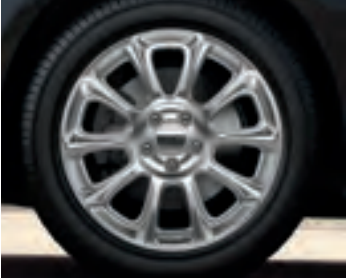
17-INCH POLISHED ALUMINUM Available on Limited