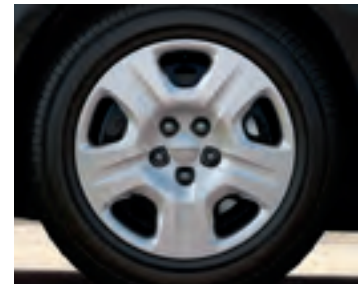
16-INCH WHEEL COVER Standard on SE