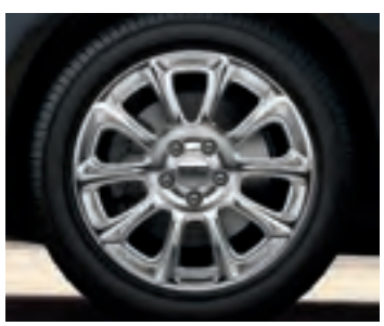
17-INCH SATIN SILVER ALUMINUM Standard on Limited