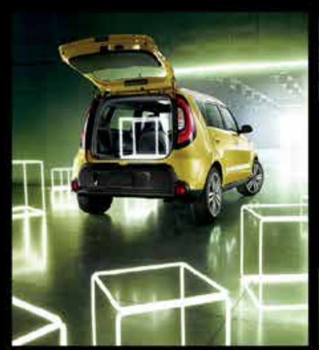
60/40 SPLIT-FOLDING REAR SEATS. Conveniently carry longer items, passengers — or a combination of both — by folding down one or both of the rear seats. Soul lets you carry all the cargo you need to suit your lifestyle with an expansive 532L (seats upright) or 1,402L (seats down) of available space.

It's your space — and the closer you look, the better it gets. A spacious, well-appointed interior lets you travel in style and comfort. Available soft-touch material within the interior, complemented by available piano black trim accents, gives it a sleek look all its own. Soul SX is available with features that enhance comfort and convenience, including panoramic sunroof, Xenon HID headlights and power adjustable driver's seat with lumbar support.