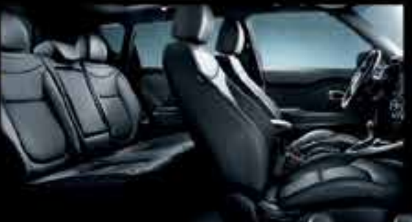
HEATED AND AIR-COOLED SEATS. Available heated front and rear seats help ensure comfortable driving in cold weather. Enjoy optimal comfort in warm weather with available air-cooled front seats that circulate cool air through perforations in the seat.