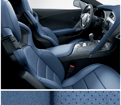
Blue Leather (3LZ)