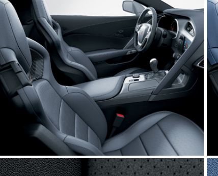
Dark Grey Leather (3LZ)