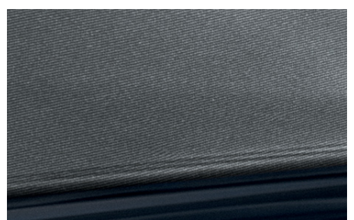
41T - Black