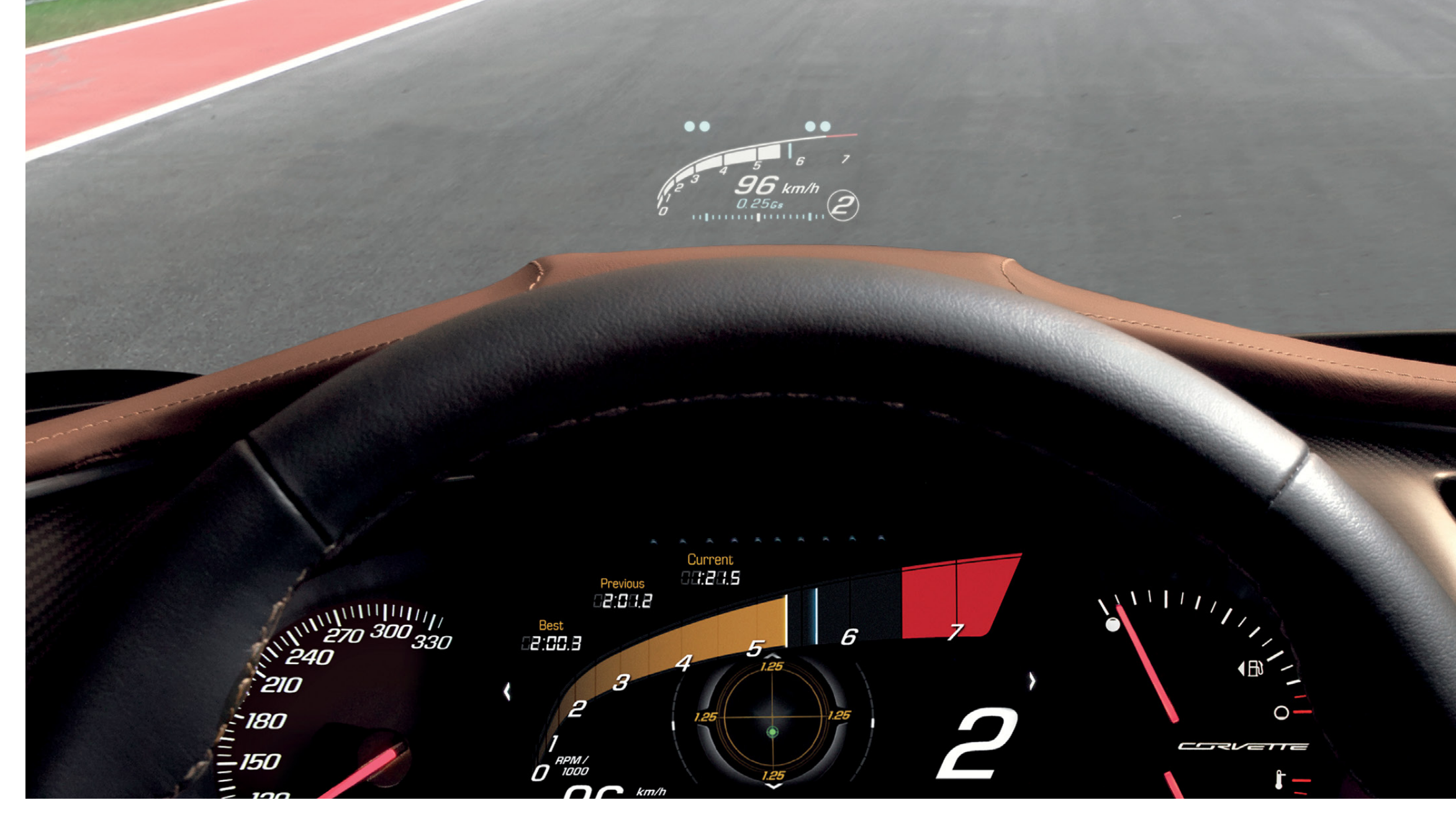
z51 PERFORMANCE PACKAGE. This package includes specific gear ratios, shocks, springs, stabilizer bars and larger front brakes with slotted rotors. Also included are 19-in. front and 20-in. rear wheels and tires for razorsharp response.