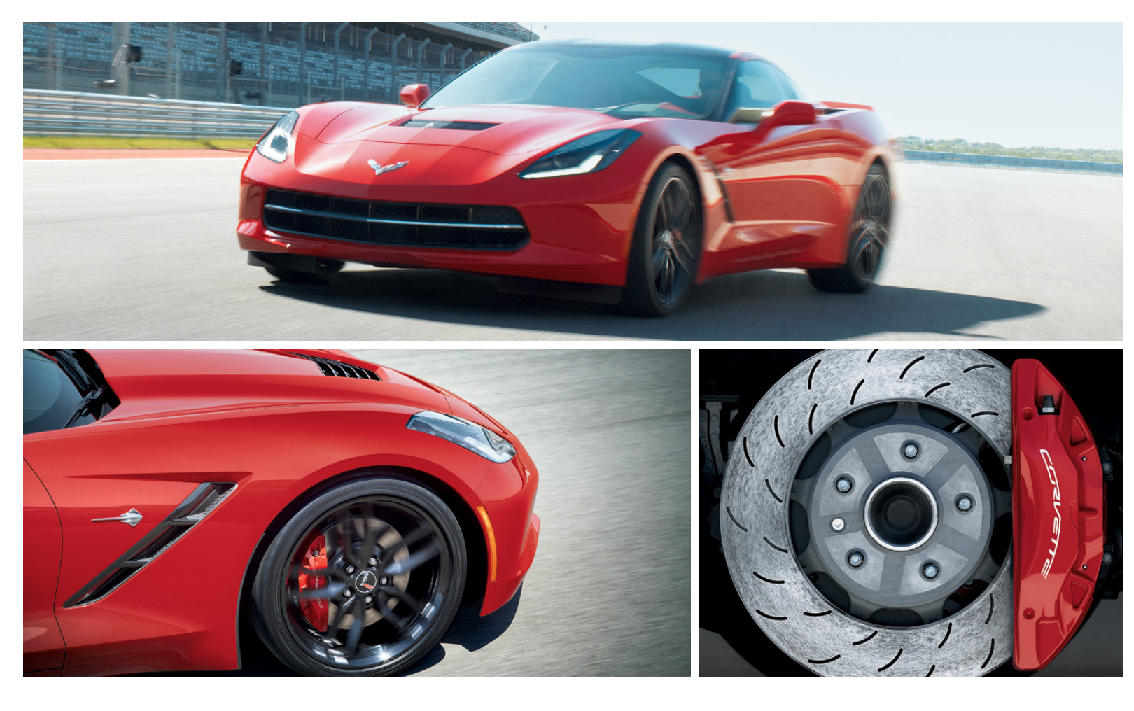
TRACK CAPABILITY. The available Z51 Performance Package features race-proven technologies: Electronic Limited-Slip Differential promotes improved stability and responsiveness. A dry-sump oil system delivers oil through high g-force cornering.