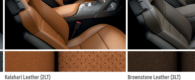
Brownstone Leather (3LT)