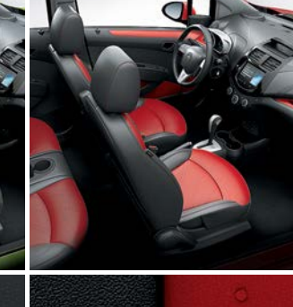
Dark Pewter-Colour Leatherette with Red Inserts and Red Trim<sup>15, 18</sup>