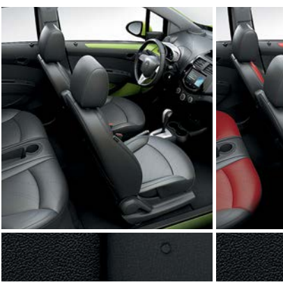
Dark Pewter-Colour Leatherette and Green Trim<sup>11, 15</sup>