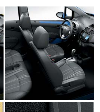
Dark Pewter-Colour Cloth with Silver Colour Accents and Blue Trim<sup>10, 13</sup>

Dark Pewter-Colour Cloth with Yellow Inserts and Yellow Trim<sup>10, 12</sup>