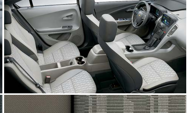
Jet Black Premium Cloth<sup>1</sup>