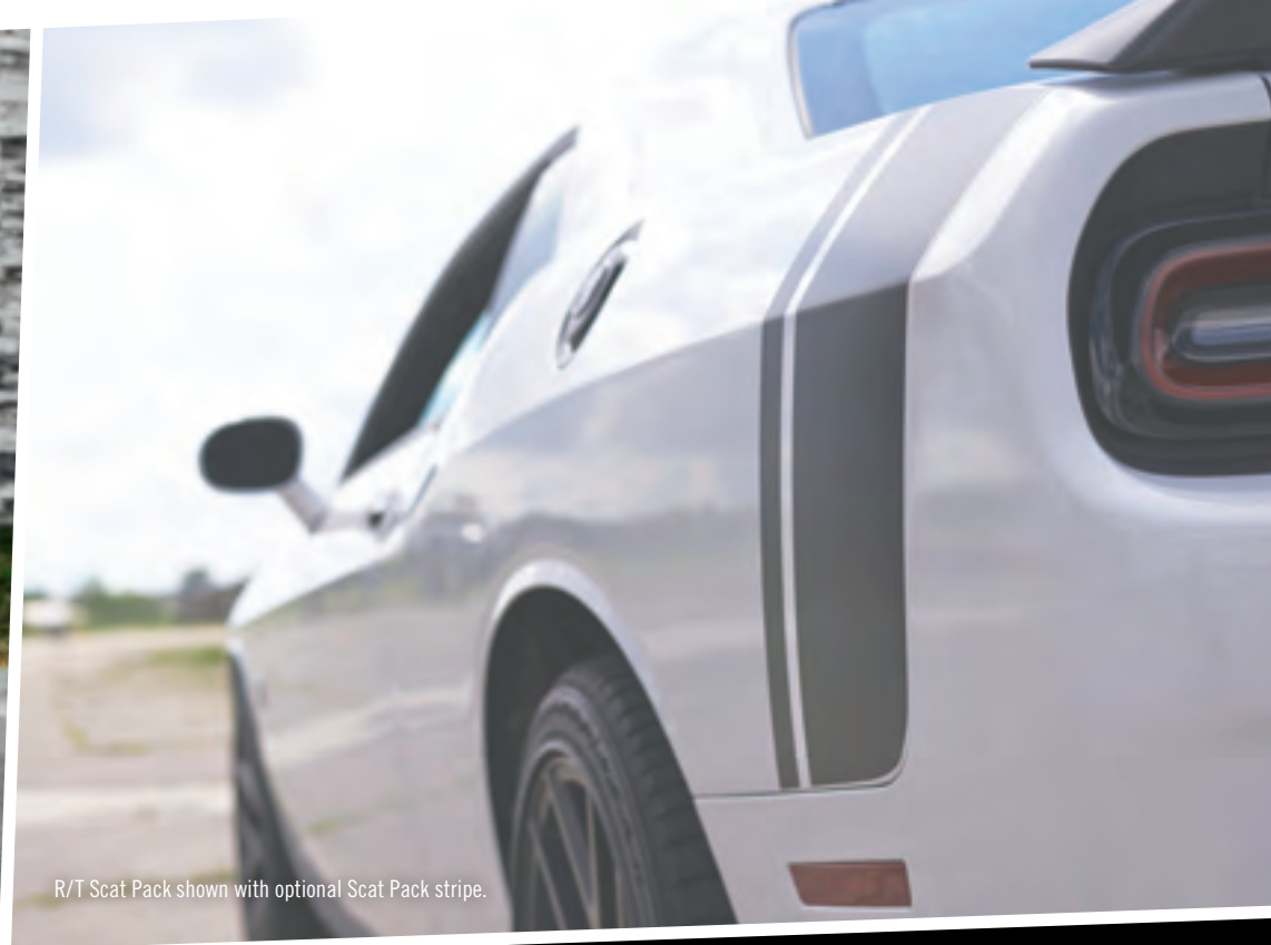
R/T Scat Pack shown with optional Scat Pack stripe.

//// THE MOST POWERFUL MUSCLE CAR. EVER!*