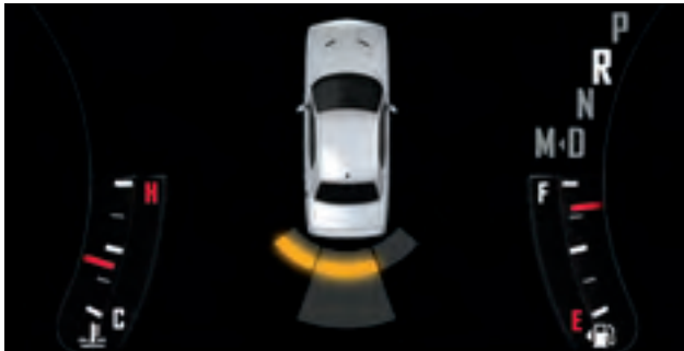
Park-Sense® Rear Park Assist 3