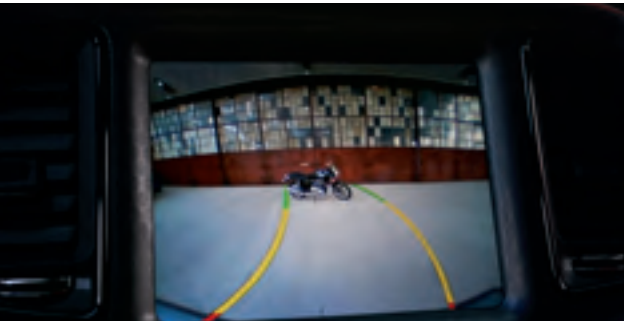
ParkView® Rear Back-up Camera with dynamic grid lines 3