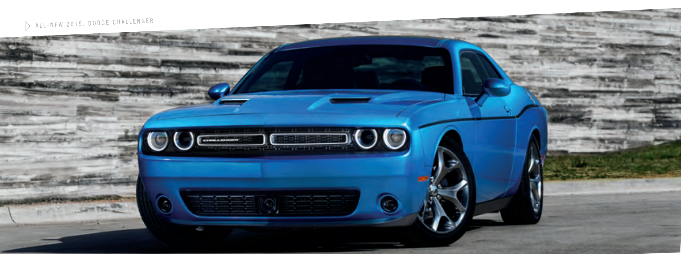
SXT Plus shown in B5 Blue.