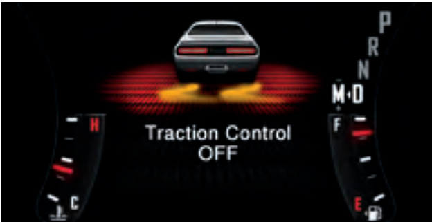
3-mode Electronic Stability Control 4