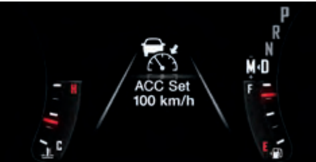
Adaptive Cruise Control 3