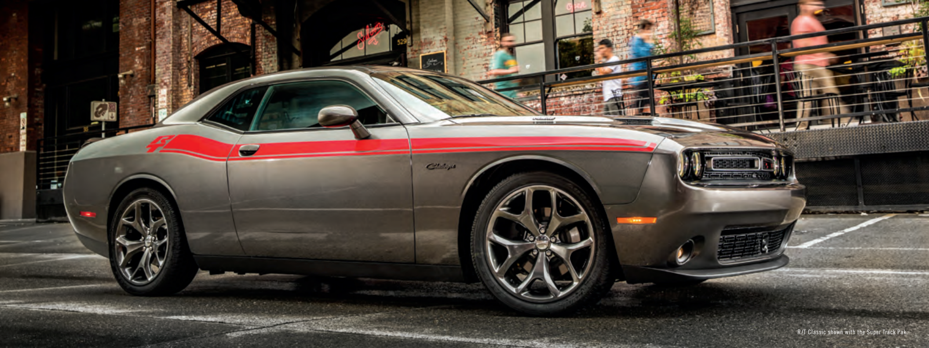
R/T Classic shown with the Super Track Pak.

HIGH INTENSITY DISCHARGE (HID) HEADLAMPS // These available headlamps produce a brighter, more natural light than halogen headlamps. The benefit is more visibility, which can improve reaction time in an emergency situation.