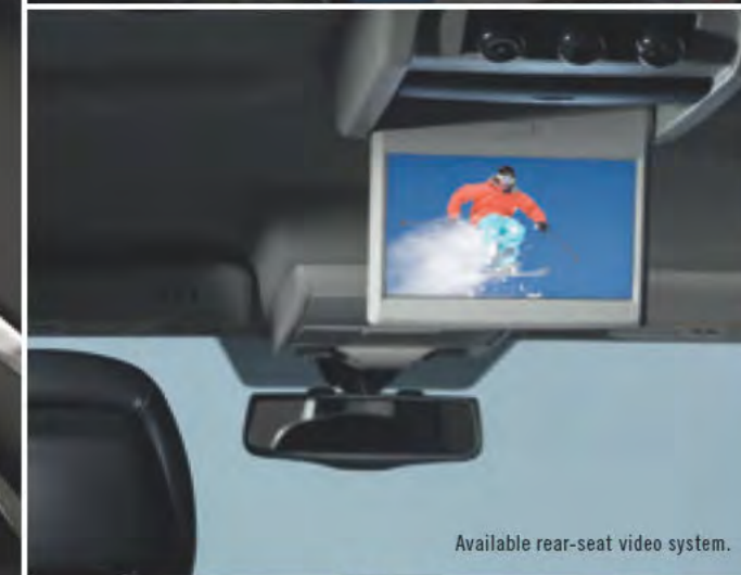
Available rear-seat video system.