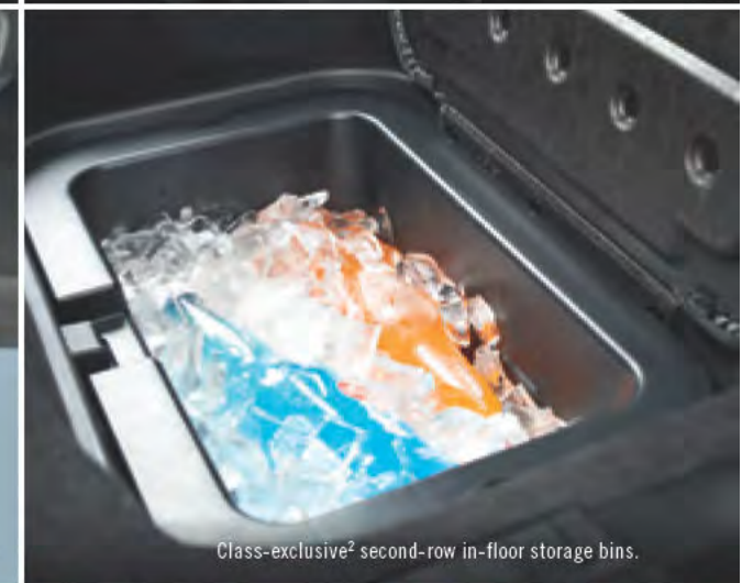
Class-exclusive 2 second-row in-floor storage bins.