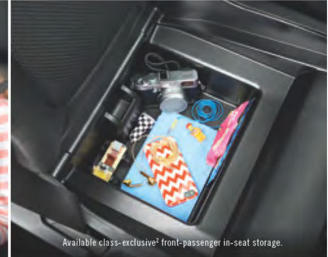
Available class-exclusive 2 front-passenger in-seat storage.