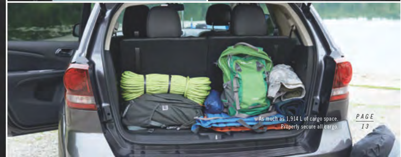
As much as 1,914 L of cargo space. Properly secure all cargo.