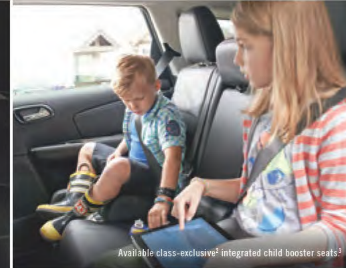
Available class-exclusive 2 integrated child booster seats. 3

Today, you and your six closest friends will celebrate in the city. Tomorrow, you'll pack up the family and their gear for a weekend away. Who and what you need to take changes daily, but the one constant is Journey — the most versatile crossover in its class. 2 The standard 60/40 split-folding and reclining second-row seating offers spacious, flexible comfort. Carrying younger passengers is a breeze with the available class-exclusive 1 integrated child booster seats, 3 and they're also easily entertained with the available rear-seat video system. Your passengers will have easy access to their available 50/50 split-folding third-row seats, thanks to rear doors that open 90 degrees, and the Tilt 'n Slide ® second-row seats.