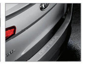
Rear bumper appliqué

Kia Genuine Parts and Accessories are engineered by Kia and installed by professionals at your Kia dealer. For more information on the full line of available Genuine Kia Parts and Accessories, see your local Kia dealer, visit www.kia.ca or call 1-877-542-2886.