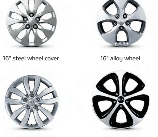
17" alloy wheel 18" alloy wheel