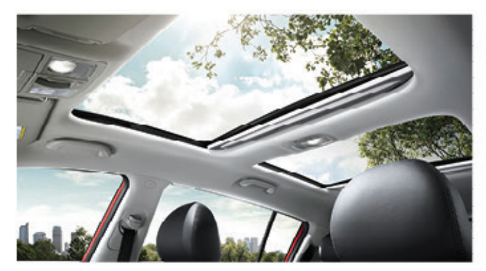
PANORAMIC SUNROOF. The available panoramic sunroof operates with tilt and slide efficiency, while featuring built-in safety mechanisms to prevent wandering hands from getting trapped.

Sportage provides spacious seating for five adults with plenty of head and legroom so everyone can relax and enjoy the drive. A sleek, contemporary instrument panel highlights the impressive interior styling. Thoughtfully designed features that include a power-adjustable driver's seat on EX and SX and available leather seat trim allow you to travel in all-day comfort.