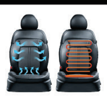
HEATED AND COOLED SEATS. Standard heated front seats and available heated rear seats help ensure comfortable driving in cold weather. Enjoy optimal comfort in warm weather with available air-cooled front seats that circulate cool air through perforations in the seat leather.