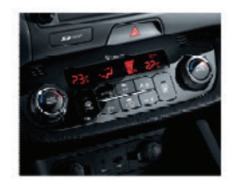
DUAL-ZONE AUTOMATIC TEMPERATURE CONTROL. Temperature control on EX and SX allows the driver and front passenger to create their own climate zones by adjusting their own temperature settings.