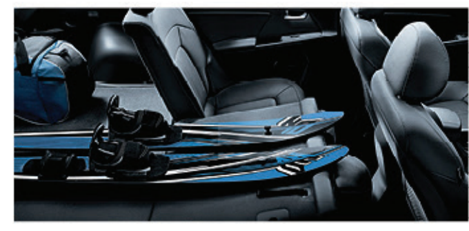
60/40 EASY-FOLD REAR SEAT. The Sportage doesn't just provide ample room for you to stow your gear, but thanks to 60:40 split folding rear seats, you can carry luggage of all shapes and sizes.