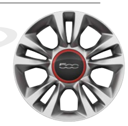
16-inch polished aluminum with Dark Technical Grey pockets and Red accented Mineral Grey pockets and Red accented centre cap, Standard on 500 Sport centre cap, Available on 500 Sport