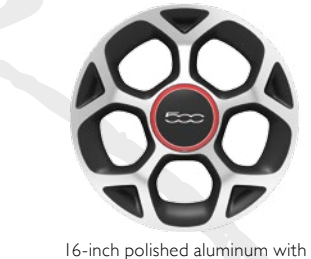
Gloss Black pockets and Red accented centre cap, Standard on 500 Turbo