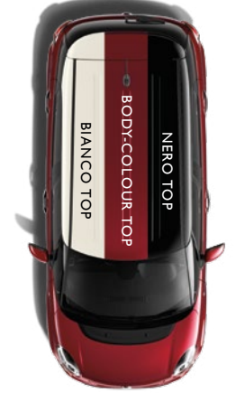
ROSSO PERLA (DEEP LAVA RED PEARL)