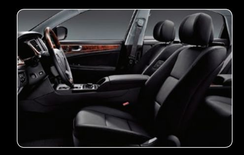
JET BLACK LEATHER / WALNUT WOOD