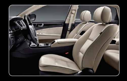
IVORY LEATHER / ASH WOOD