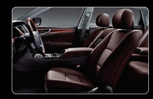
SADDLE BROWN LEATHER / MADRONA WOOD