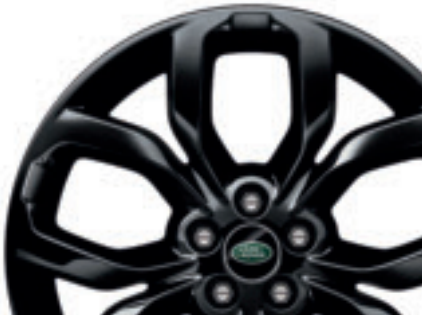
19" Five Split-Spoke Alloy Wheel with Gloss Black Finish