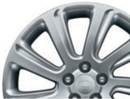
18" Ten-Spoke Alloy Wheel