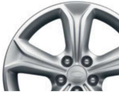
17" Five-Spoke Alloy Wheel