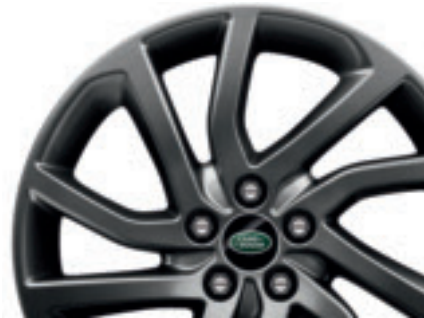
18" Five Split-Spoke Alloy Wheel with Satin Dark Grey Finish