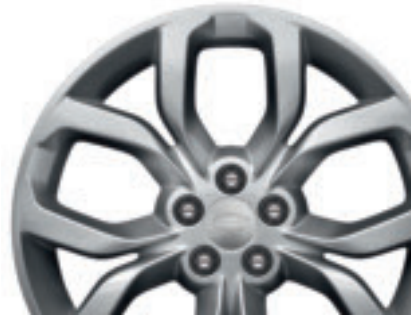
19" Five Split-Spoke Alloy Wheel