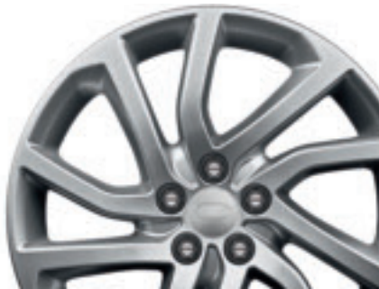
20" Five Split-Spoke Alloy Wheel