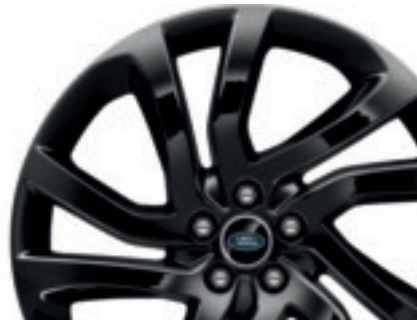
20" Five Split-Spoke Alloy Wheel with Gloss Black Finish