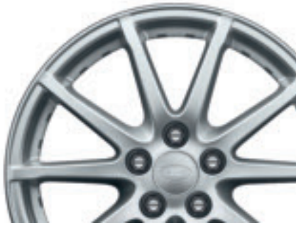
17" Ten-Spoke Alloy Wheel