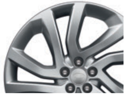
18" Five Split-Spoke Alloy Wheel