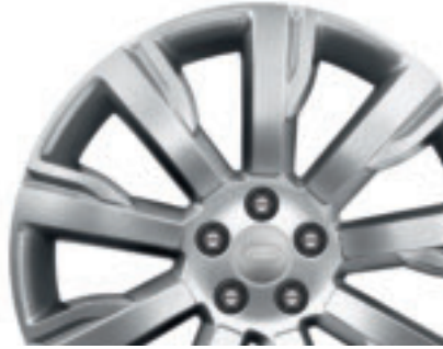
19" Nine-Spoke Alloy Wheel