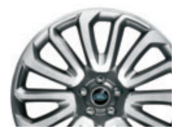
22" Seven Split-Spoke Vibration Polished Diamond Turned Finish Alloy Wheels