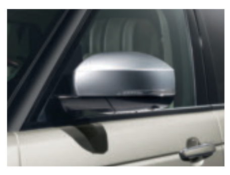
Mirror Caps - Noble

Dark Atlas options replace key Light Atlas or body coloured exterior parts. Dark Atlas side vents (pair) are available as separate accessories and perfectly complement the door finishers included within the trim pack.