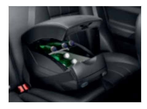
Centre Armrest Cooler/Warmer Box Food and drinks chiller and warmer that acts as a rear centre armrest. With a leather covered top, it is held in place by the centre seat belt and powered from the rear auxiliary socket. Ideal for long journeys with the family.