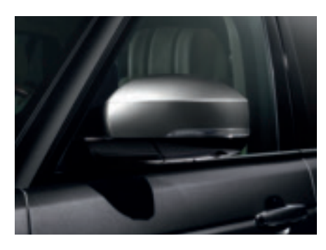
Mirror Caps - Dark Atlas

Noble plated mirror caps complement the Range Rover's exterior styling cues.