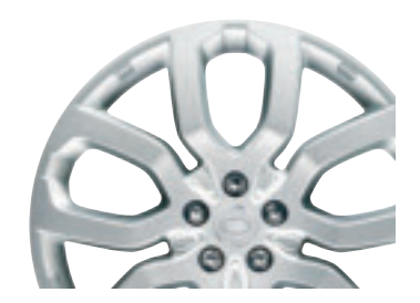
22" Five Split-Spoke Sparkle Silver Finish Alloy Wheels