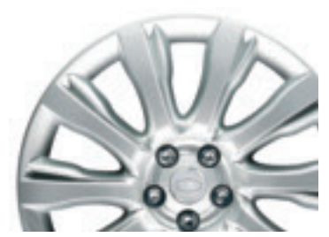
21" Ten-Spoke Sparkle Silver Finish Alloy Wheels