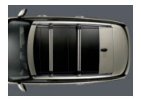
Roof Rails and Cross Bars Maximum permissible load capacity 100kg. Design features pre-set positioning holes/dowels to ensure cross bars are fixed in optimum position for weight distribution and dynamics.