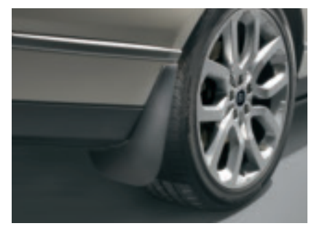
Rear Mudflaps Mudflaps help reduce spray and help protect the paintwork. Supplied as a pair.