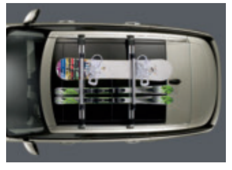
Ski/Snowboard Holder Carries four pairs of skis or two snowboards and is lockable for security. Incorporates slider rails for easy loading. Maximum payload 36kg.