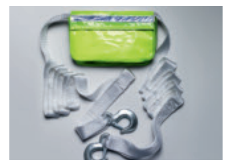
Tow Recovery Strap Includes storage bag that can be attached as a warning flag to the strap. 3,000kg maximum load capacity.