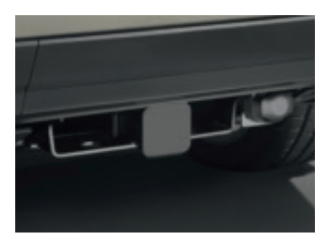
Towing Electrics NAS towing electrics capable of supplying all trailer rear lighting and interior equipment power.