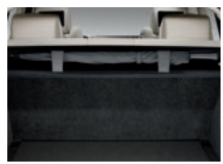
Loadspace Umbrella Holder This neat storage solution provides stowage for one full size umbrella.