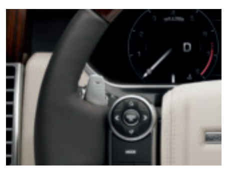
Gearshift Paddles – Aluminum Anodized finish ensures exceptional wear resistance. Hand brushed for a premium finish in silver or red.