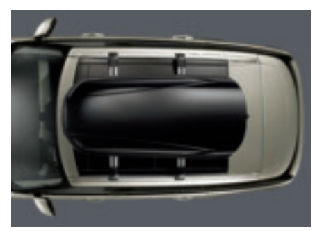
Luggage Carrier Flexible rack system to facilitate roof carrying. Maximum payload 75kg.