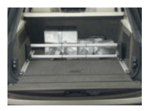
Loadspace Retention Kit Pack of attachments that fit into the loadspace rails via a quick lock/release system to help provide a flexible solution for retaining items.