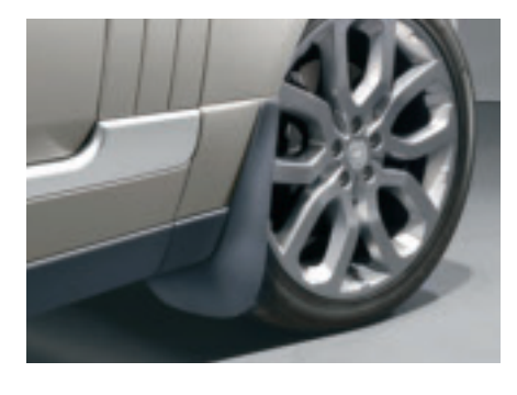
Front Mudflaps Mudflaps help reduce spray and help protect the paintwork. Supplied as a pair.