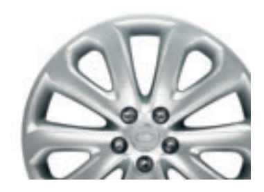
20" Five Split-Spoke Sparkle Silver Finish Alloy Wheels