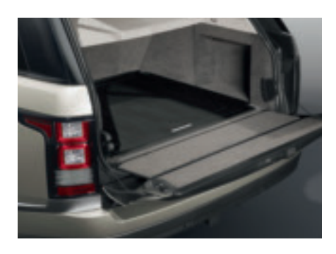
Loadspace Rubber Mat Range Rover branded rubber mat helps protect the rear loadspace carpet from general dirt. Waterproof and non-slip surface.