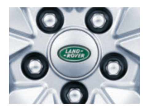
Land Rover Centre Cap Land Rover branded alloy wheel centre caps.