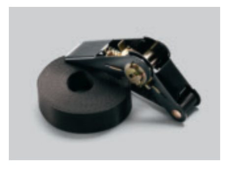
Ratchet Strap Nylon tie strap for securing items to the cross bars and luggage rack when roof carrying. Five metres long, 20mm wide and supplied individually.