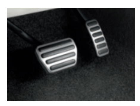
Sports Pedal Kit Pedal caps feature a Bright design and hidden fixings for a clean finish.