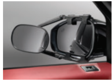
Towing Mirror Extension Premium towing mirrors with a Land Rover branded stowage bag.