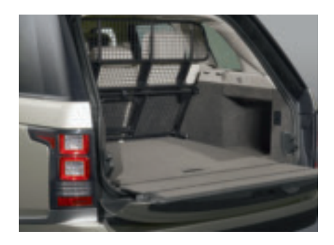
Cargo Barrier This useful barrier helps prevent cargo from entering the passenger compartment. Incorporates integral ski hatch. Not compatible with Rear Executive Class seating.