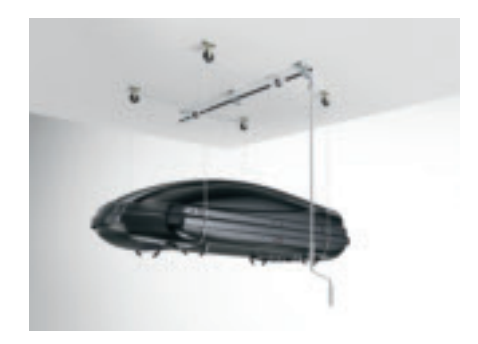
Universal Lift & Load System This roof loading aid fixes to a garage roof and allows equipment to be lifted onto the vehicle with ease. It can also be used for storing the roof box conveniently when removed from the vehicle.