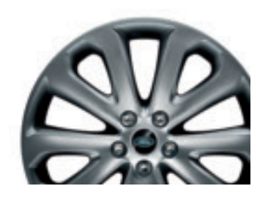
20" Five Split-Spoke Shadow Chrome Finish Alloy Wheels