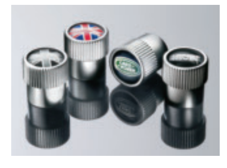
Styled Valve Caps There is an exclusive range of styled valve caps providing choice of Range Rover and Land Rover branded caps, Union Jack, Black Jack and Nitrogen designs. These provide a subtle styling enhancement.