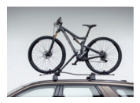
Roof Mounted Bike Carrier Raised roof rails and cross bar kit required and will accommodate two bike carriers. Lockable bike carrier designed for holding a single bike, up to 20kg.