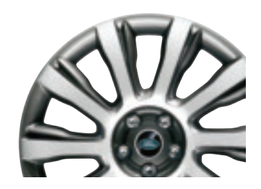
21" Ten-Spoke Diamond Turned Finish Alloy Wheels