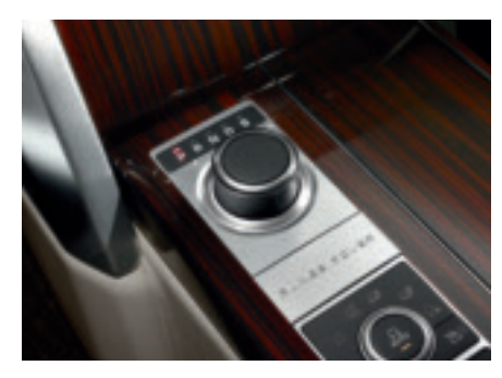
Leather Covered Rotary Shifter Enhance the appearance of your vehicle's interior with this premium rotary shifter with leather topper.