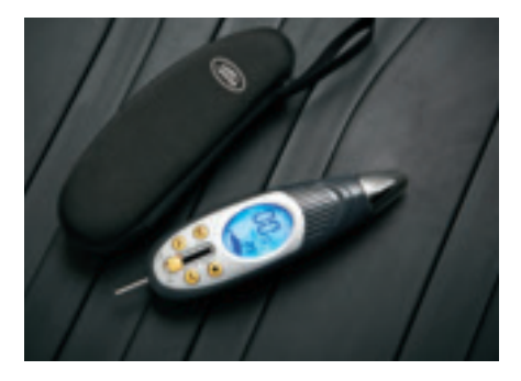
Tire Pressure Gauge Stores recommended pressure and has a unique 360° rotating nozzle to locate tire valve, LED light, tread depth gauge, measuring in psi, bar, kpa, kg/cm² and comes complete with storage case.