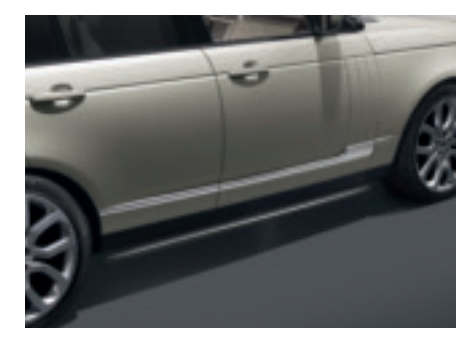
Side Protection Tubes

Fixed side steps aid entry and exit to the vehicle and improve access to the roof.