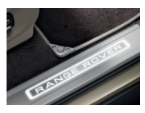
Illuminated Tread Plates Illuminated tread plates with Range Rover lettering and halo surround. Sold as a vehicle set.