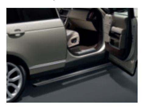
Deployable Side Steps

Dark Atlas options replace key Light Atlas or body coloured exterior parts. Dark Atlas mirror covers (pair) complete the look of the exterior trim pack – Dark Atlas.