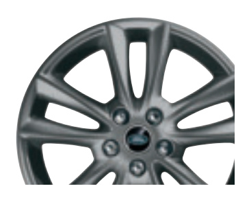
19" Five Split-Spoke Alloy Wheels