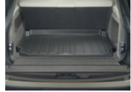
Loadspace Semi-Rigid Liner Semi-rigid waterproof loadspace protector adds a raised lip feature on three sides to protect side wall carpets.