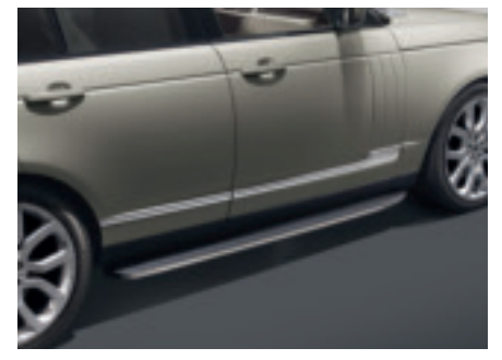
Fixed Side Steps

These smart, practical steps make it easier to get in and out of the vehicle. Neatly stowed under the sills, the side steps automatically deploy as soon as the door is opened, or when activated by the key fob. They stow automatically when the door is closed. The side steps are sensitive to obstructions and will not deploy in off-road or low range settings.