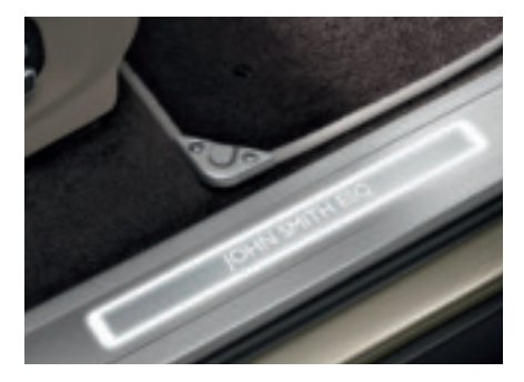
Personalized Illuminated Tread Plates Personalized illuminated tread plates offer you the chance to specify a monochrome 'motif' of your choice in a variety of scripts which will be highlighted by white lighting. Personalized tread plates can be ordered as a pair of front tread plates or alternatively as a vehicle set. The rear tread plates supplied in the vehicle set are illuminated (not personalized).