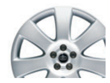
22" Seven-Spoke Sparkle Silver Finish Alloy Wheels