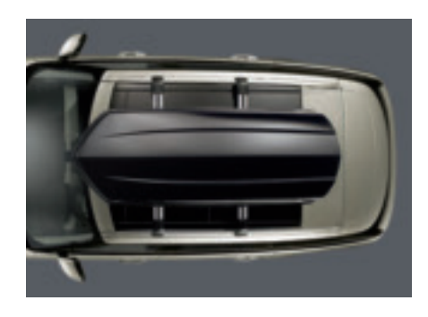
Large Sports Roof Box Power-click quick mounting system with integrated torque indicator for easy and secure fixation with a single-handed grip. The 430 litre large sports roof box opens from both sides with handles on the lid and inside the box, for convenient fitting, loading and unloading.