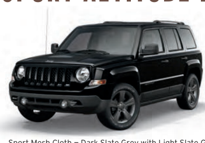
accent stitching (shown right) Standard on Sport Altitude II Sport Mesh Cloth - Light Pebble Beige with Tangerine accent stitching