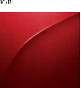
Temptation Red (M) BC/BL