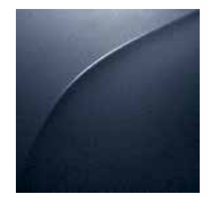
Gravity Blue (M) BC/BL