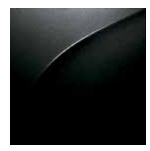
Aurora Black BC/BL