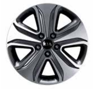
16" alloy wheels