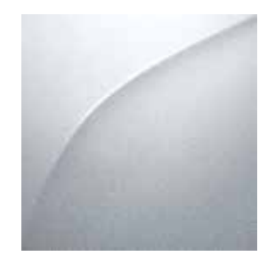
Ultra Silver (M) BC/BL