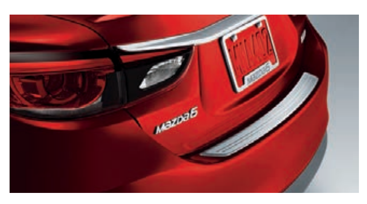
REAR BUMPER GUARD

Life doesn't have to be messy, at least not inside your MAZDA6. This flexible, durable Cargo Tray* protects against spills and other damage. Removes easily for quick cleanup.