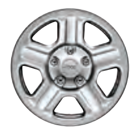
16-inch slot-spoke styled steel Standard on Sport