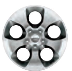
18-inch polished aluminum with Granite Crystal painted pockets Standard on Sahara®