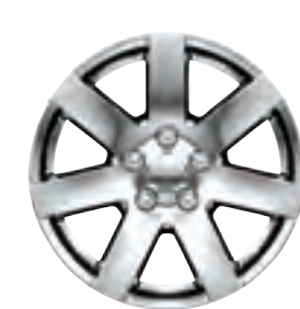
18-inch seven-spoke polished aluminum Available on Sahara