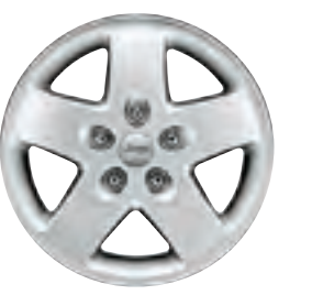
17-inch Moab Sparkle Silver aluminum Standard on Sport S; Available on 2-door Sport