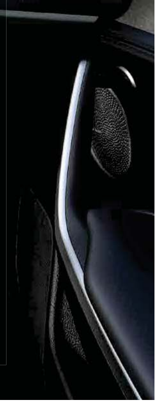
International model shown.

Stinger helps keep your smartphone fully juiced with available built-in wireless charging.<sup>2</sup>