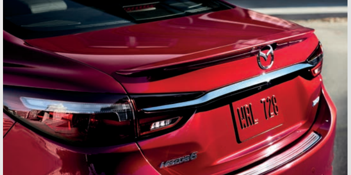
REAR SPOILER Tailored to the contours of your Mazda, our Rear Spoiler further enhances its sleek lines and aerodynamics.