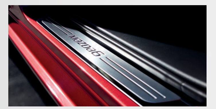
DOORSILL TRIM PLATES A touch of class coming and going. Dress up your MAZDA6 with these stylish Doorsill Trim Plates.

REAR BUMPER GUARD Tailored and sleek, our durable stainless steel Rear Bumper Guard not only looks great, but helps protect the rear bumper from chips and scratches.