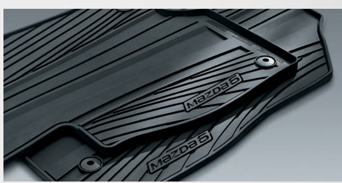
ALL-WEATHER FLOOR MATS Fitted perfectly to your MAZDA6, these All-Weather Floor Mats guard against water, sand, mud, snow or whatever you drag through the door.