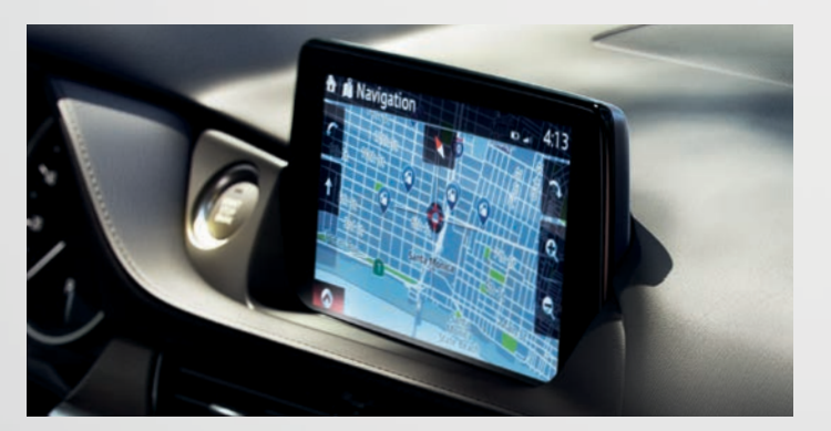
NAVIGATION Enjoy all the advanced features of today's navigation devices, including voice commands and advanced lane guidance with our factory-integrated navigation system. The system even offers a 3D interactive map with step-by-step audio directions.