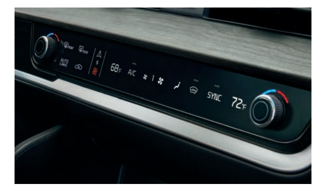
Infotainment/climate switchable controller<sup>1</sup> share the same LCD softkey keyboard. Press the fan icon to transform the controls on the right to climate, and press the arrow icon to switch them to infotainment.

The cabin of the all-new Sportage is designed to be relaxing and spacious. It's filled with an impressive range of standard and available technologies for your convenience, comfort, and confidence.