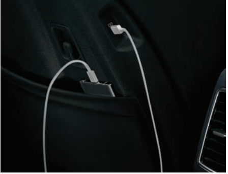
USB charging ports <sup>1</sup> for rear passengers are conveniently located in the seatbacks ahead of them.