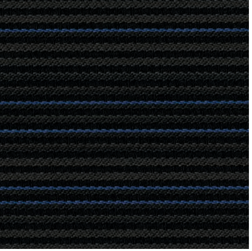
Black Cloth S|SVPLUS