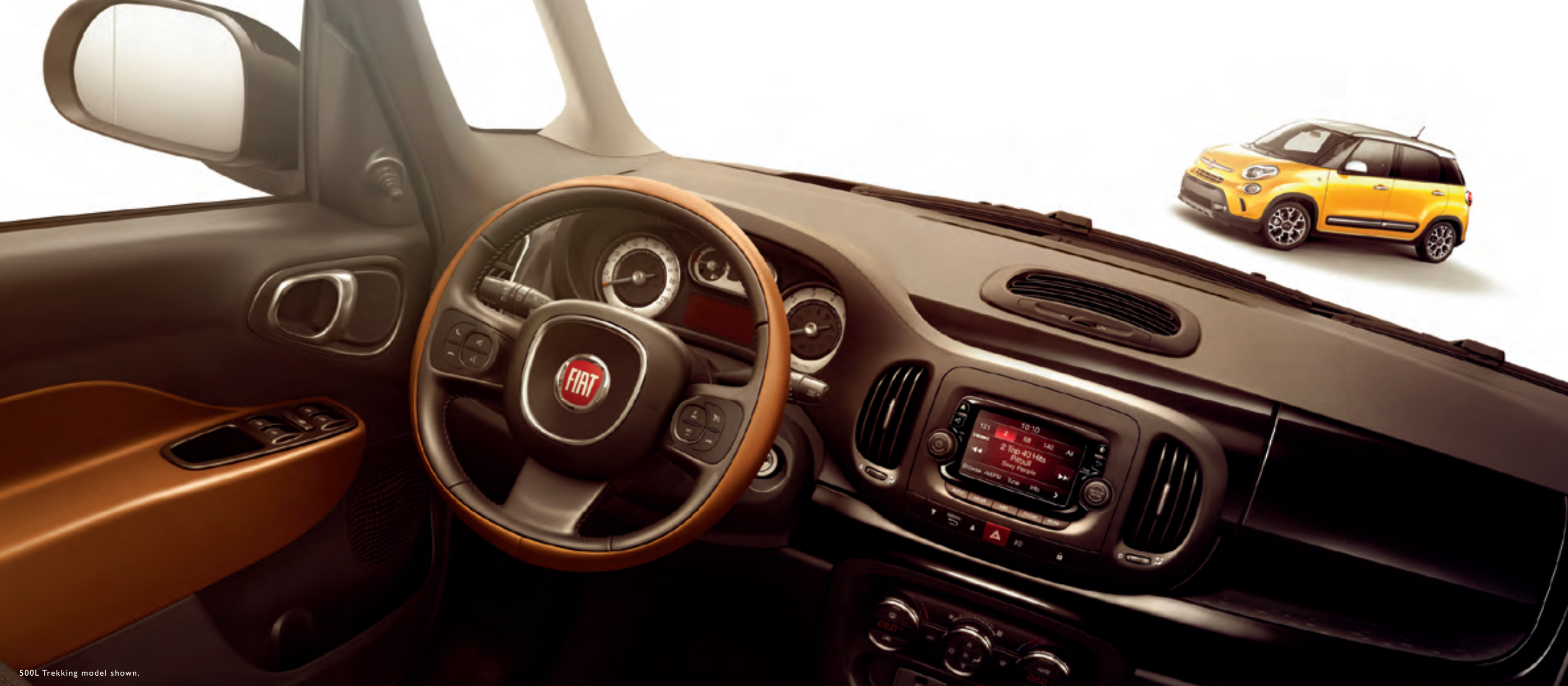
500L Trekking model shown.

STASH IT Clutter is a designer's greatest enemy, so it's no surprise that our designers make excellent use of the impressive 654 L of cargo volume in the FIAT® 500L — preserving the clean lines of its superbly turned-out interior. With 2823 L of interior volume, 500L stores passengers just as efficiently, too. Seating configurations include an adjustable second row that allows you to instantly flip, fold and slide for extra leg and cargo room; plus, there's a fold-flat front passenger seat for versatile packing. Organization is king with thought-out touches like the dual glove box and multi-position cargo shelf.