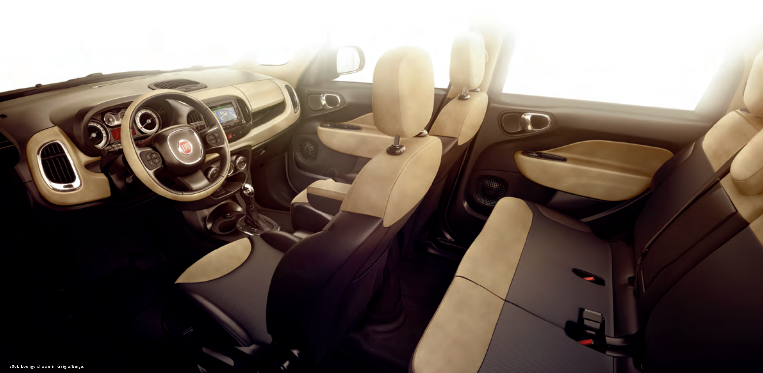
500L Lounge shown in Grigio/Beige.