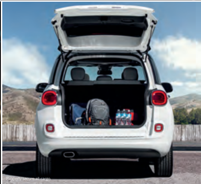
Properly secure all cargo.