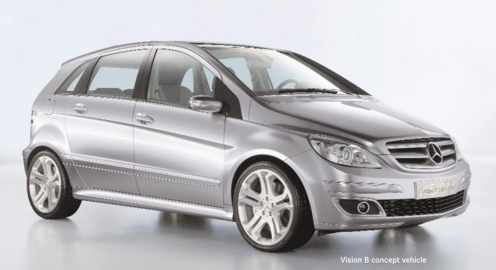
Vision B concept vehicle