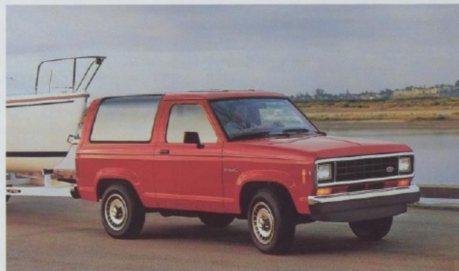
Bronco II is a great vehicle for recreational boat or trailer towing.