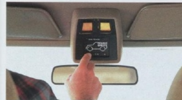
Optional Touch-Drive electric shift 4x4 transfer case

Touch-Drive has other great features as well. Two special electrical interlocks prevent possible powertrain damage that might otherwise be