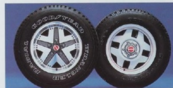
Cast aluminum wheels; White sport wheels