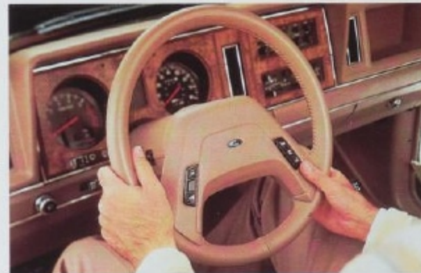
Speed control and tilt steering wheel

Among the features of this electronic stereo system are lighted liquid crystal display and illuminated controls, fully electronic manual or seek tuning, memory for 18 station settings (6 AM and 12 FM), and separate bass and treble controls. The cassette tape player features auto-reverse and Dolby® noise reduction. Also included are balance and fader controls for the front and rear speakers. All Bronco II sound systems for 1987 feature a digital clock.