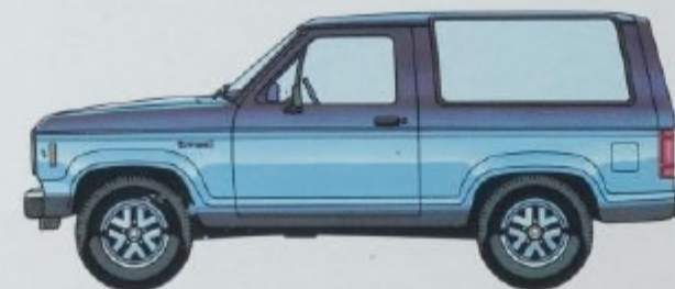
■ Body Color ■ Accent Color

Give your Bronco II XLT or XL series the distinctive style of Deluxe Two-Tone paint. The accent color is applied to mid-bodyside/liftgate below the chamfer and above the rocker area. A 2-color tape stripe at the two-tone break is included.