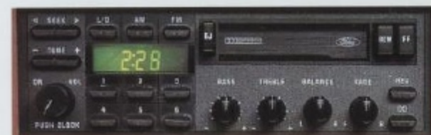
Electronic AM/FM stereo radio with cassette tape player