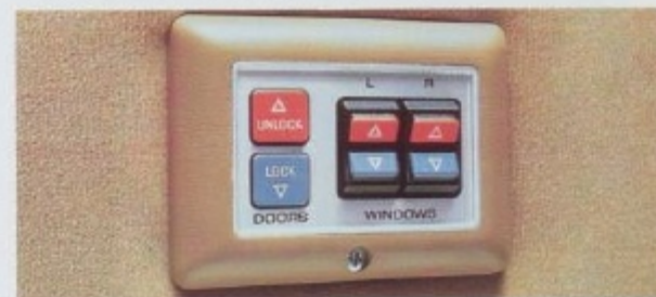
Power windows and door locks