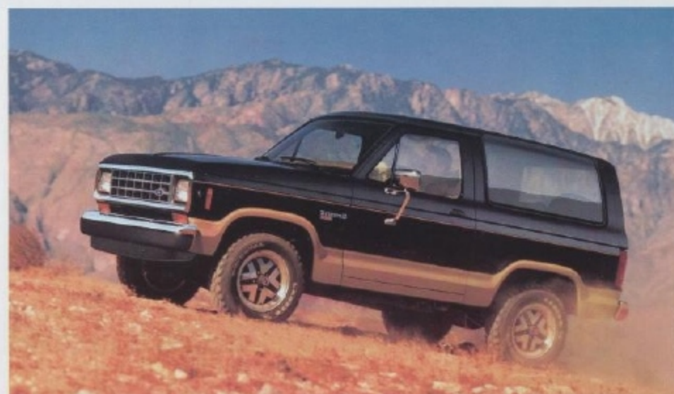
Four-wheeling enjoyment is yours in a V6-powered, fun-tough Bronco II 4x4.