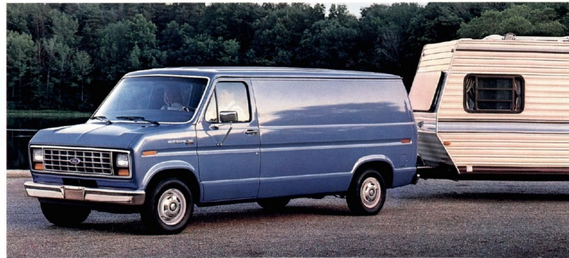
Econoline Van, properly equipped, is engineered to tow a heavy boat or trailer.

All Econoline models are equipped with standard power-assisted steering and braking systems. Plus all-season steel-belted radial tires for traction. And the E-150 model features gas-pressurized shock absorbers for smooth riding comfort. These features and many others make Econoline Van a pleasure to drive.