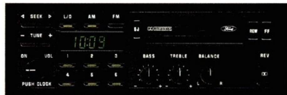
Electronic AM/FM stereo radio with cassette tape