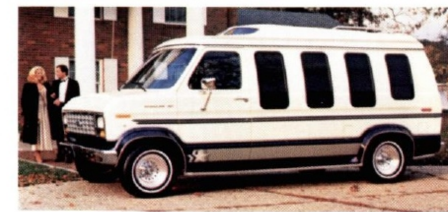
Econolines with aftermarket custom van conversions.