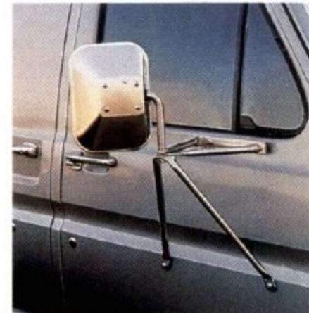
Bright swing-out recreational mirrors

Among the features of this electronic stereo system are Dolby® noise reduction, seek tuning that selects the next listenable station either up or down scale, manual tuning, and fast forward/rewind buttons for the cassette tape. Also, separate bass/treble controls and left/right balance. New features for 1987 include a power amplifier and an electronic digital clock.