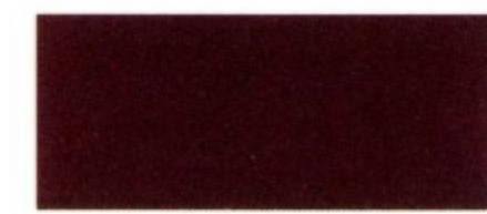
Midnight Canyon Red Metallic