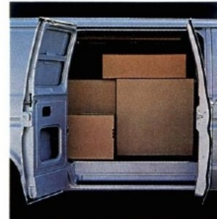
Hinged side cargo doors (no extra cost)