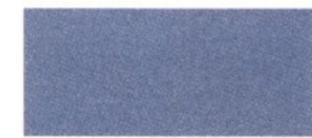
Light Regatta Blue Metallic