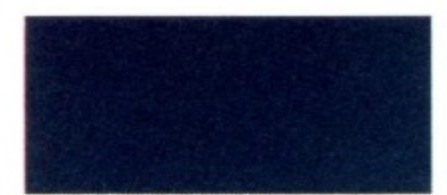
Dark Shadow Blue Metallic