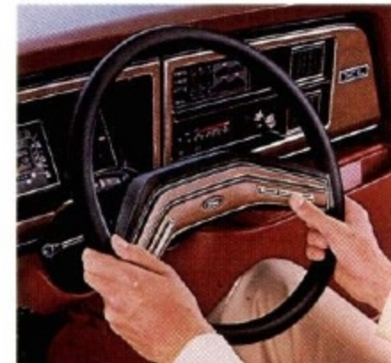
Speed control and tilt steering wheel