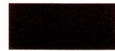
Dark Walnut Metallic