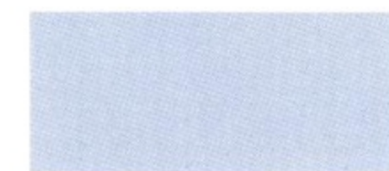
Light Regatta Blue