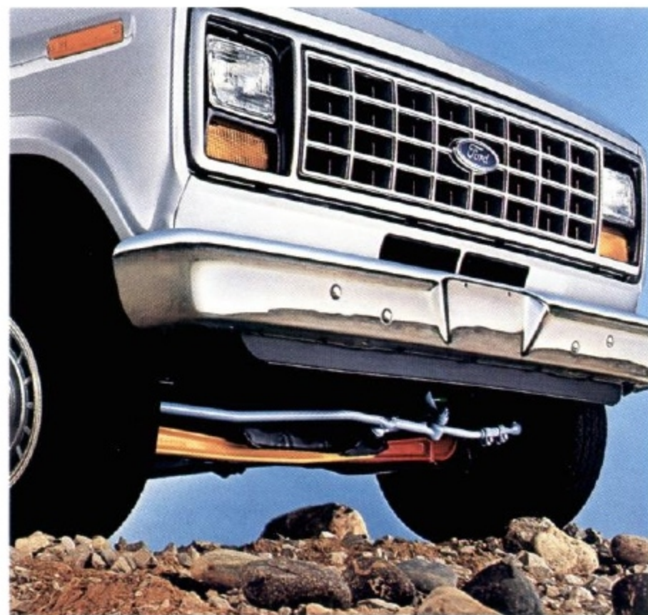
Twin-I-Beam independent front suspension

This Ford-engineered independent front suspension system is yet another feature found only in an Econoline cargo van. Each wheel has its own forged I-beam axle and separate big coil spring to handle rough road conditions independently. And the front coil springs are computer-selected to match automatically the gross vehicle weight rating (GVWR) and the weight of optional equipment.