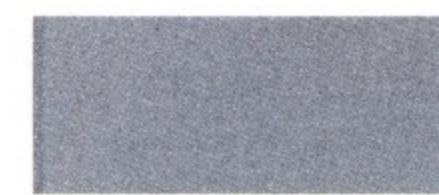
Medium Silver Metallic