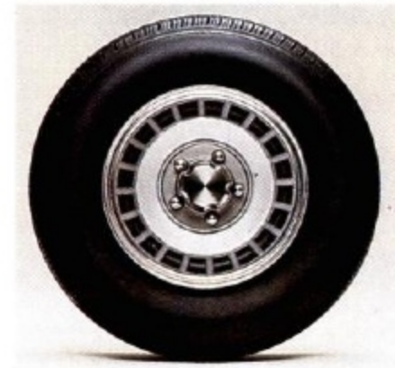
Sport wheel covers (E-150 only)