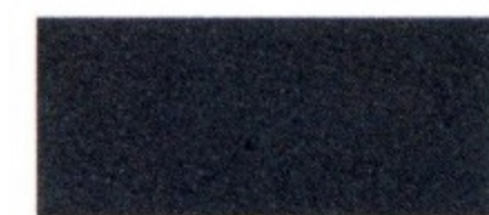
Dark Grey Metallic

Some of these paint colors are shown in this catalog. On the printed page, of course, colors are at best only representative of the originals. Your Ford Dealer can show you actual samples of paint colors as well as interior trim materials.