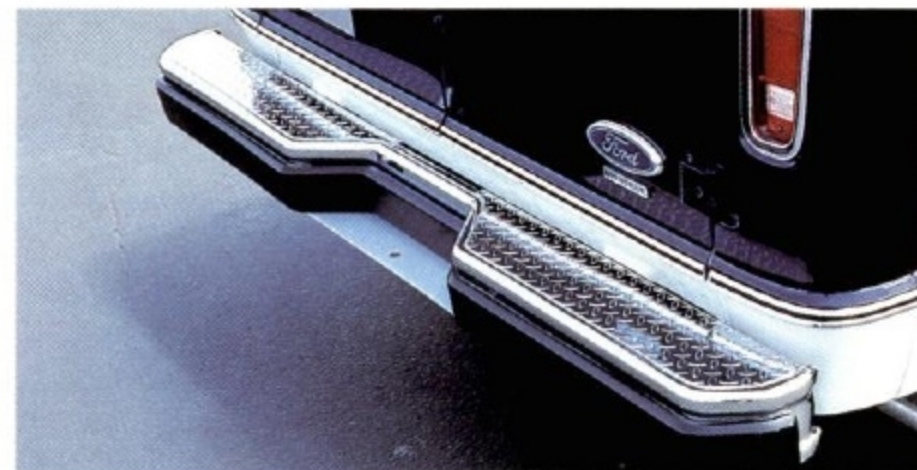
Chrome rear step bumper