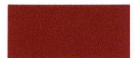
Dark Canyon Red