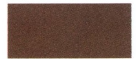
Desert Tan Metallic