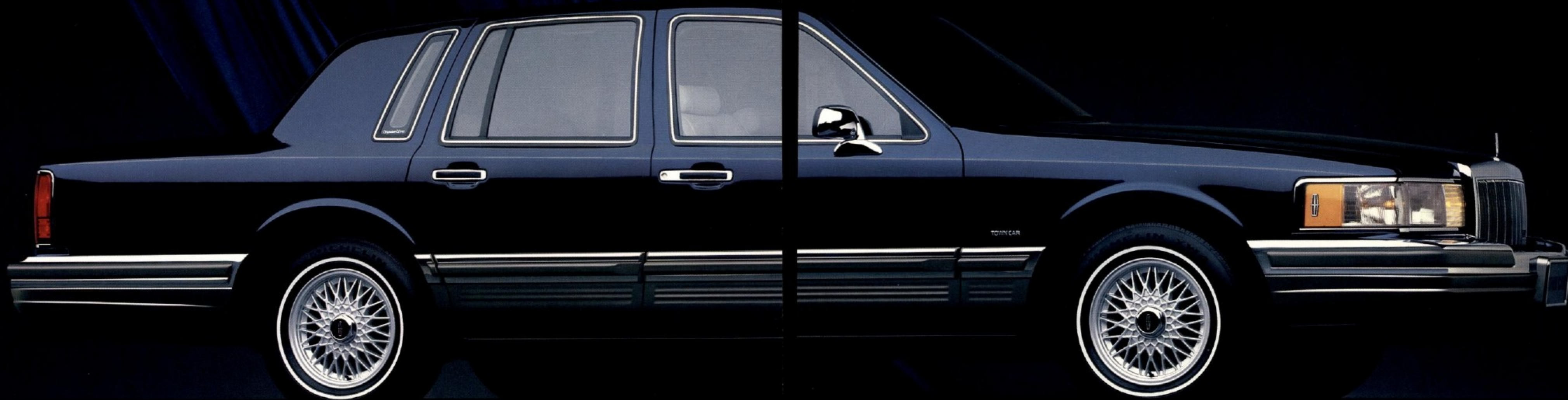
Lincoln Town Car Signature Series (above) in Twilight Blue Clearcoat Metallic. Signature Series interior (below) with Light Titanium leather seating surfaces. Some features shown may be optional.