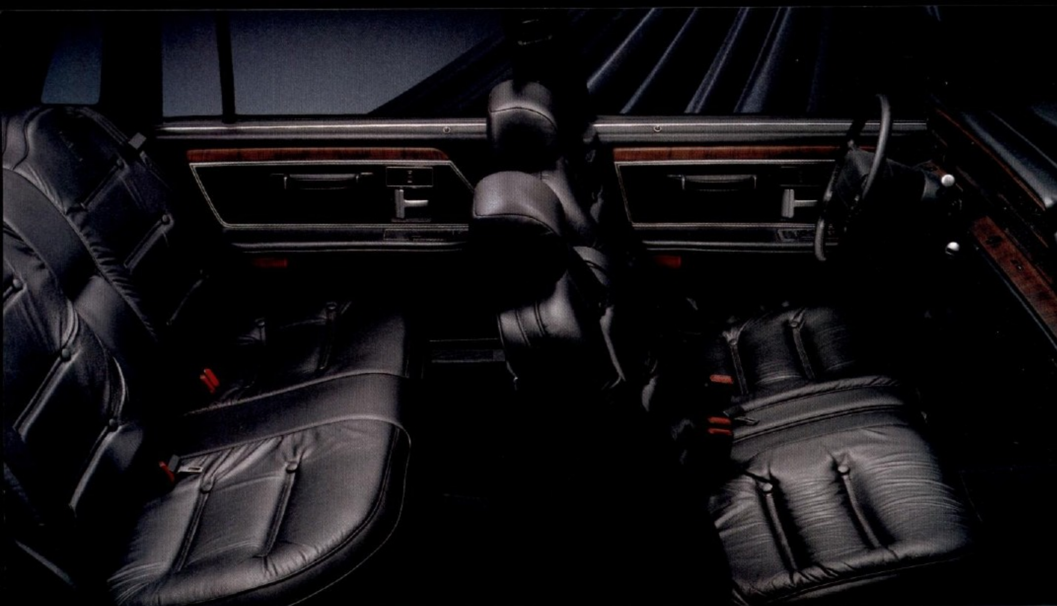
Lincoln Continental Signature Series (below) in Midnight Black Clearcoat. Signature Series interior (above) with Ebony leather seating surfaces. Some features shown may be optional.