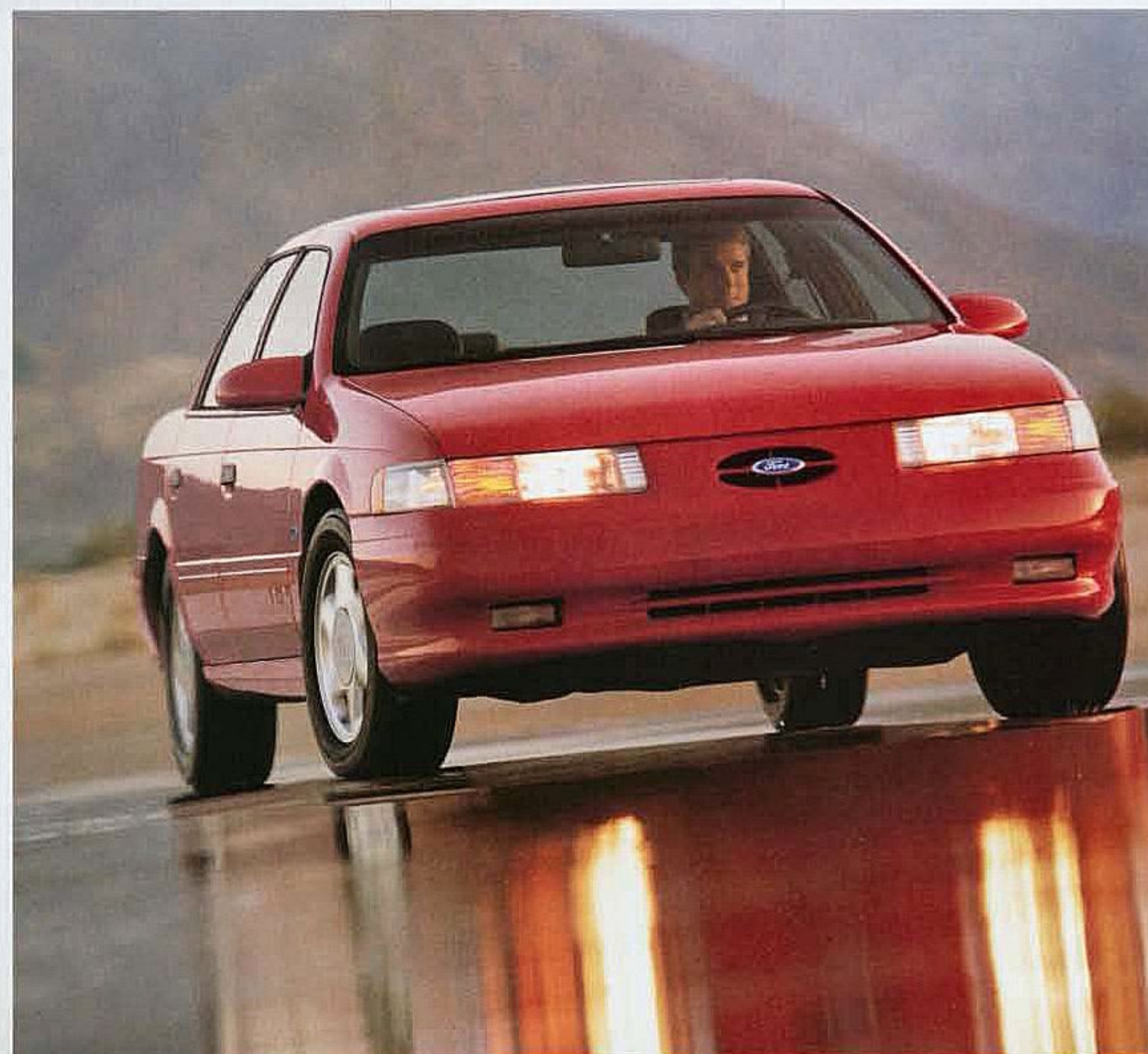
Taurus SHO shown in exclusive Ultra Red Crimson Clearcoat. Some equipment shown is optional.