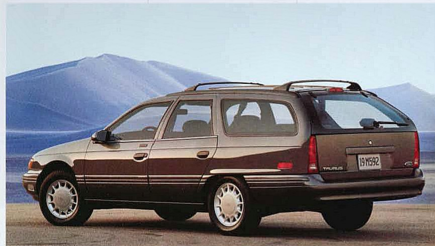
Upper Left: the luxurious Taurus LX interior in Opal Grey. Above: Taurus LX Wagon in Opal Grey Clearcoat Metallic. Some equipment shown is optional.