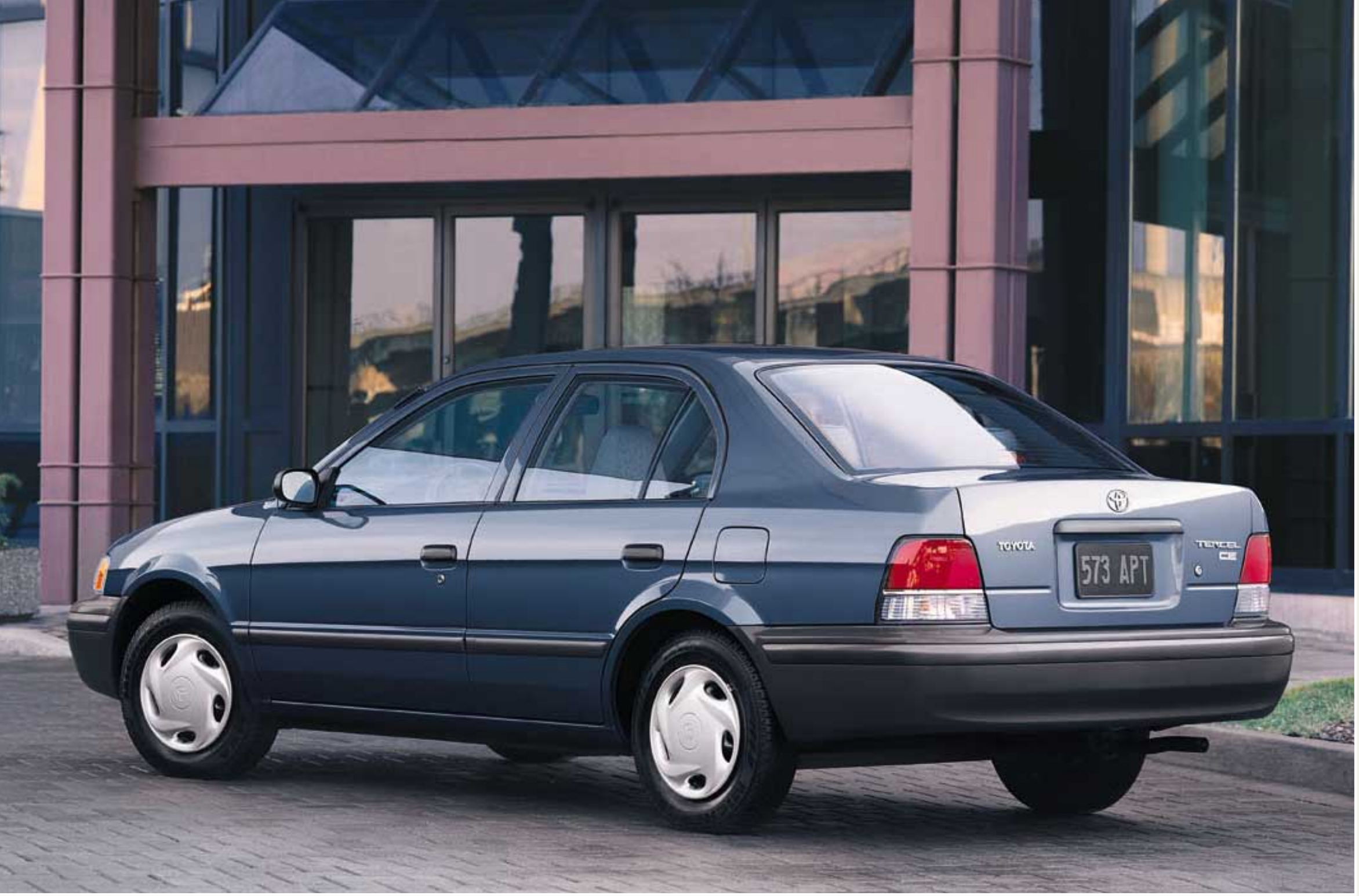
Tercel 4-Door CE shown in Vista Blue Mica with optional equipment