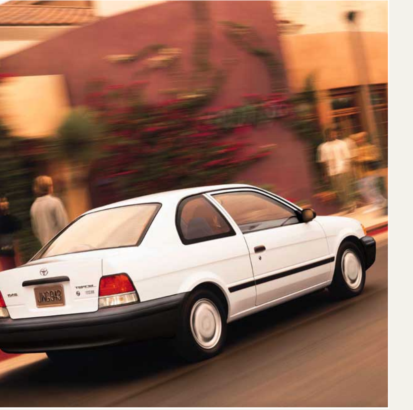
Tercel 2-Door CE shown in Alpine White with optional equipment