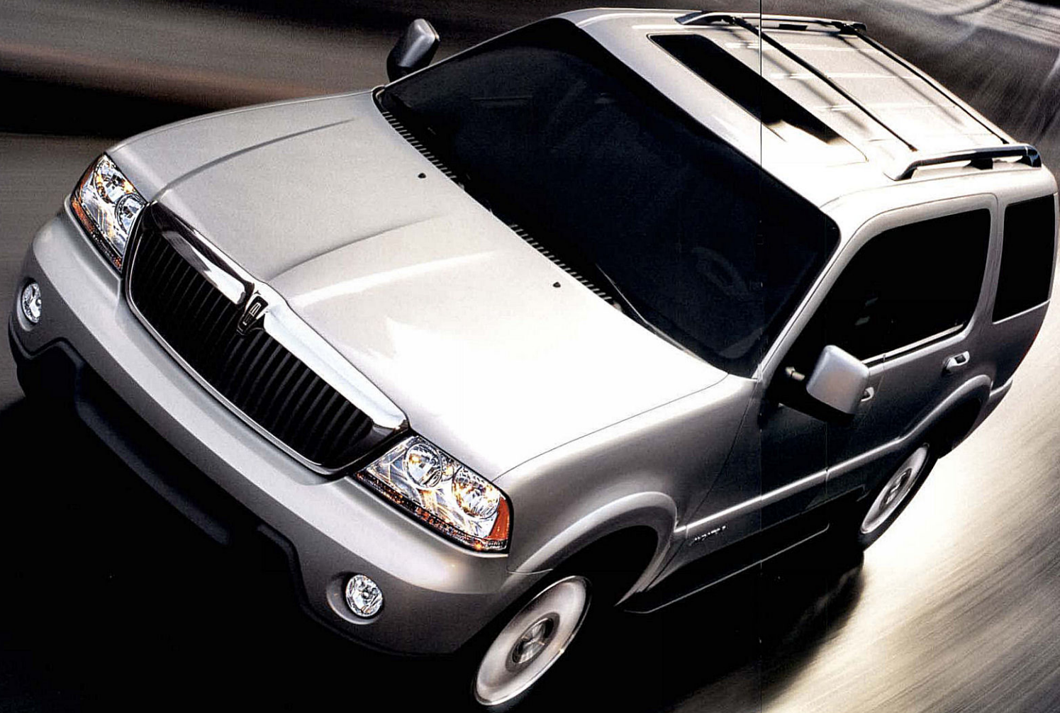
Lincoln Aviator Premium All-Wheel Drive in Silver Birch Metallic Clearcoat. Shown with available equipment.