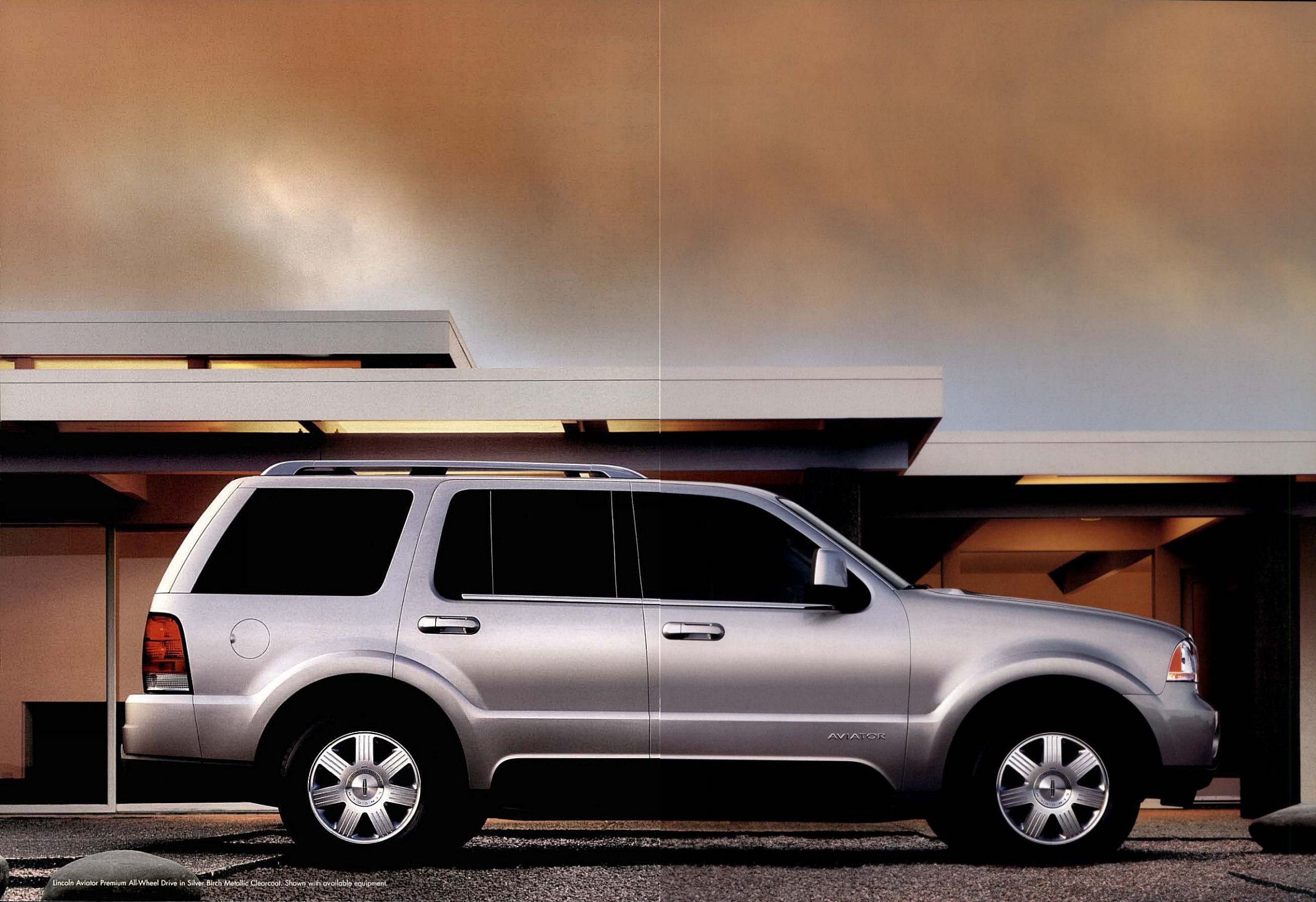
Lincoln Aviator Premium All-Wheel Drive in Silver Birch Metallic Clearcoat. Shown with available equipment.