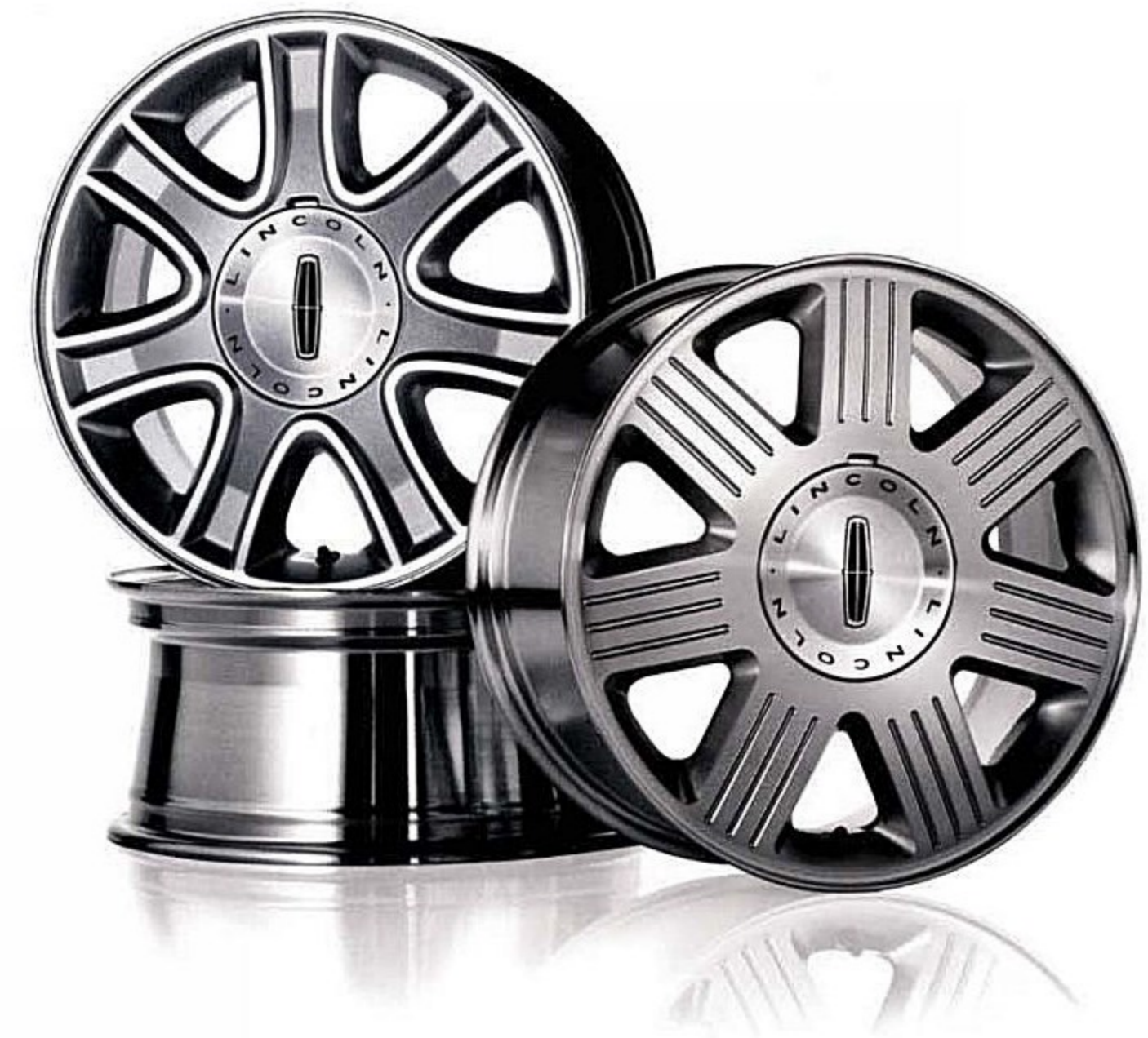
Wheels shown from left to right: 17-inch 7-spoke painted aluminum, 17-inch 7-spoke machined aluminum.