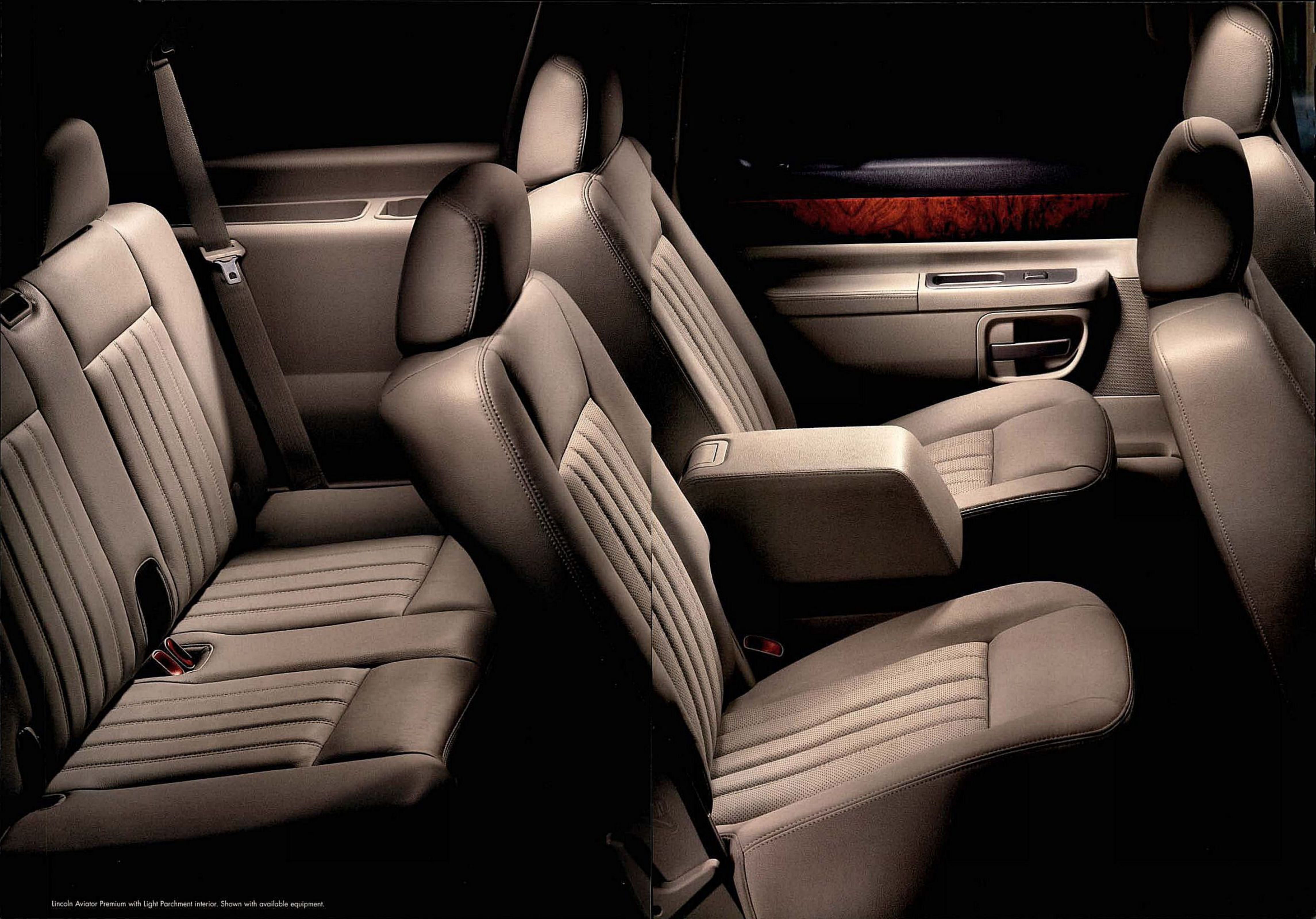
Lincoln Aviator Premium with Light Parchment interior. Shown with available equipment.