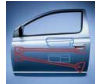
Above: Side-impact door beams made of high-strength steel offer additional protection.

immediately reduces slack in the seatbelt, helping reduce the risk of injury. The force limiter then allows the seatbelt to "give" gradually to help minimize further injury. That's important because you never know what you could encounter on the road.