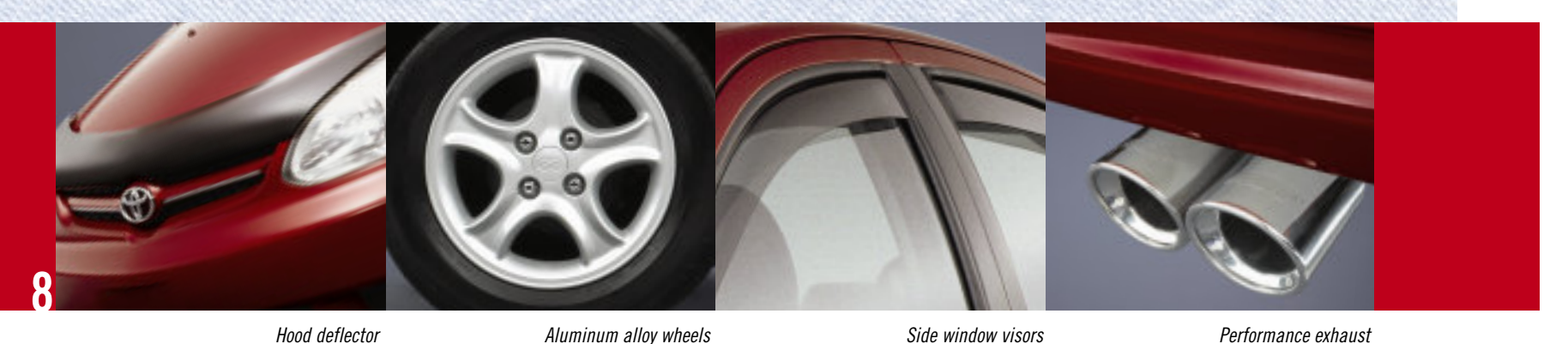
Enhance the look and functionality of your new Echo Sedan

DRESS IT UP. DRIVE IT OUT. Make your statement. Your new Toyota Echo Sedan can very easily become a reflection of your personality and lifestyle. All you have to do is select which of the Toyota Accessories you'd like to add to your Echo Sedan to make it truly yours. Your Toyota dealer will gladly assist you in customizing your new vehicle. To find the Toyota Dealer nearest you, go to toyota.ca or call 1-888-TOYOTA-8.