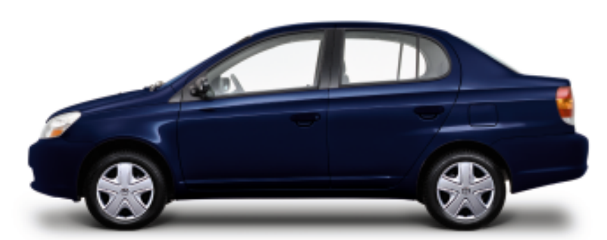
Echo Sedan shown in Indigo Ink.