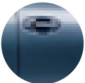
8S2 Seaside Pearl 1