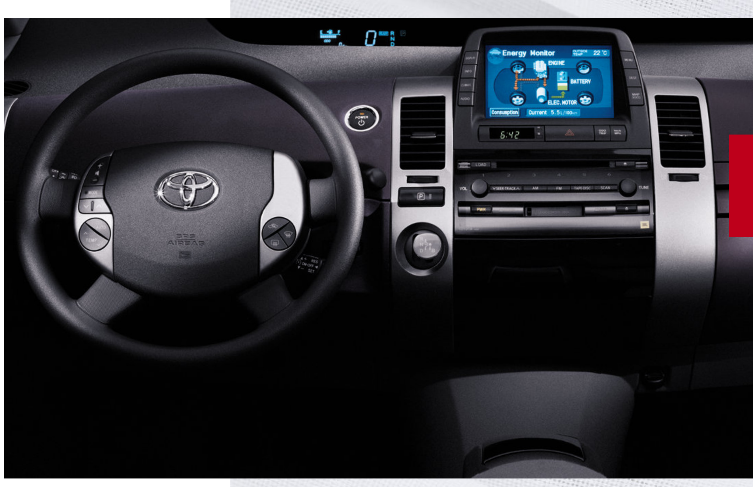
Above: Prius dash shown with optional equipment.

already the most technically advanced car in its class, there's an available DVD-based navigation system, a JBL premium AM/FM, cassette, 6-disc CD changer with 9-speakers and a diversity antenna for a sound you – and your ears – simply will not believe. Prius. Another word for "tomorrow."