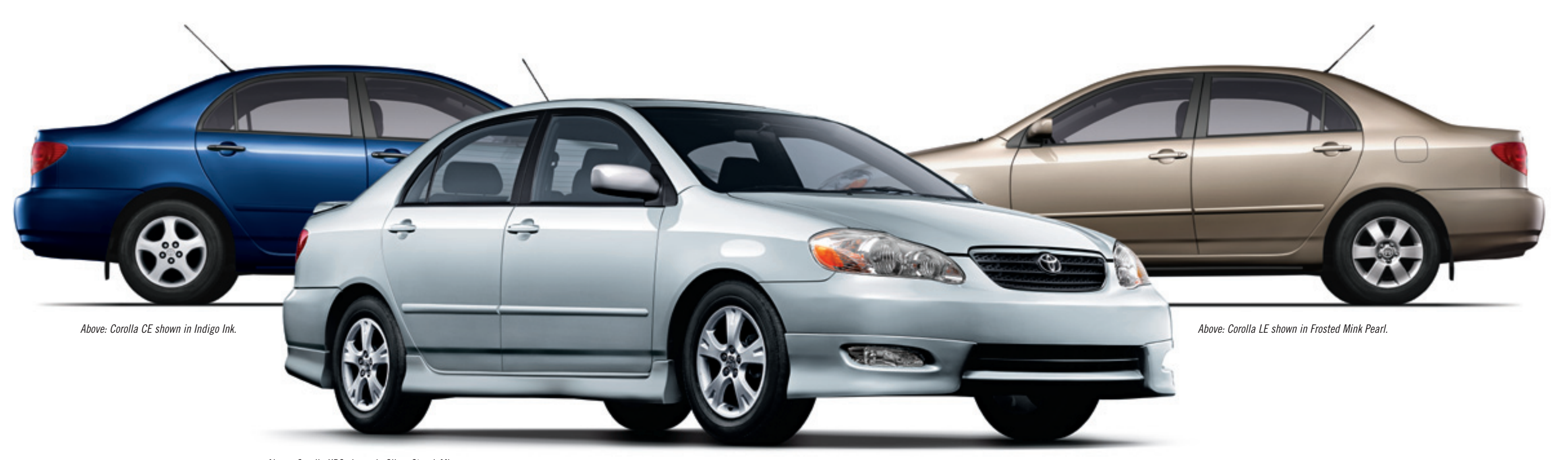
Above: Corolla XRS shown in Silver Streak Mica.