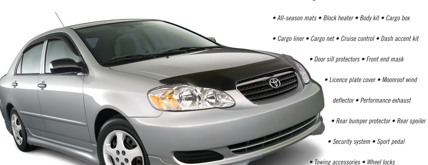
Corolla all dressed up with a rear lip spoiler, a hood deflector and a "body kit" which includes front and rear bumper chins and side skirts.