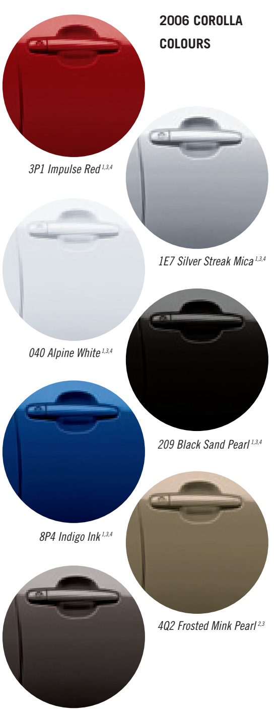
1E3 Phantom Grey Pearl 1,3,4