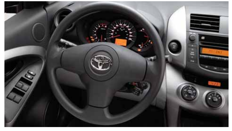
Above top: RAV4 Base model shown in Pacific Blue Metallic and above, the Base model dash.