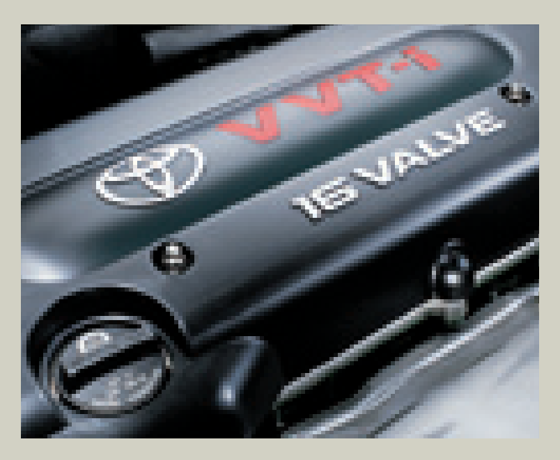
A lift of the hood unveils yet another Matrix revelation: a 1.8 Litre, 4-cylinder, 126 hp engine that accounts for Matrix's noteworthy responsiveness.