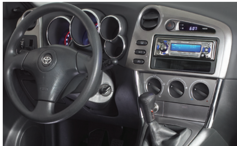
ABOVE: TRD SPECIAL EDITION PACKAGE INTERIOR FEATURES.

ABOVE: MATRIX SHOWN IN SILVER STREAK MICA WITH OPTIONAL TRD SPECIAL EDITION PACKAGE.