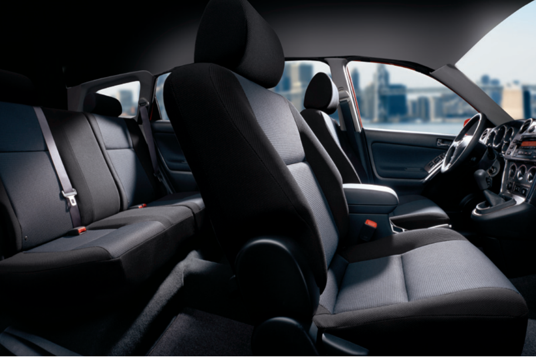
ABOVE: MATRIX XR FWD FABRIC INTERIOR SHOWN IN DARK GREY. BELOW: THE MATRIX 60/40 SPLIT FOLD-DOWN REAR SEAT AND FOLD-FLAT FRONT PASSENGER SEAT.

<sup>1</sup> SEE SPECIFICATIONS SECTION FOR MORE INFORMATION ON CARGO HAULING.