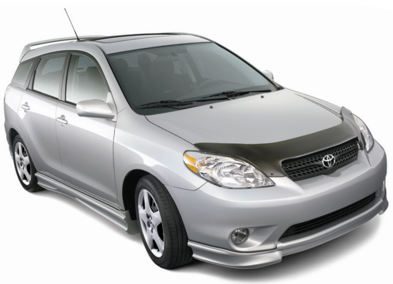
MATRIX ALL DRESSED UP WITH A REAR SPOILER, A HOOD DEFLECTOR AND A "BODY KIT" WHICH INCLUDES FRONT AND REAR BUMPER CHINS AND SIDE SKIRTS.

ALL-SEASON MATS BLOCK HEATER BODY KIT CARGO BOX CARGO LINER CARGO MAT CARGO NET CAR TENT CRUISE CONTROL EMERGENCY ASSISTANCE KIT EXHAUST TIP FIRST AID KIT HOOD DEFLECTOR LICENCE PLATE COVER OWNER'S WALLET SECURITY SYSTEM SIDE WINDOW VISORS SPORT PEDALS SUNROOF WIND DEFLECTOR TOWING ACCESSORIES WHEEL LOCKS