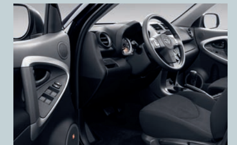
ABOVE: RAV4 SPORT 4WD V6 INTERIOR INCLUDES AM/FM CD/MP3 PLAYER WITH 6-SPEAKERS, AUXILIARY AUDIO INPUT JACK AND AUTO SOUND LEVELIZER (ASL).