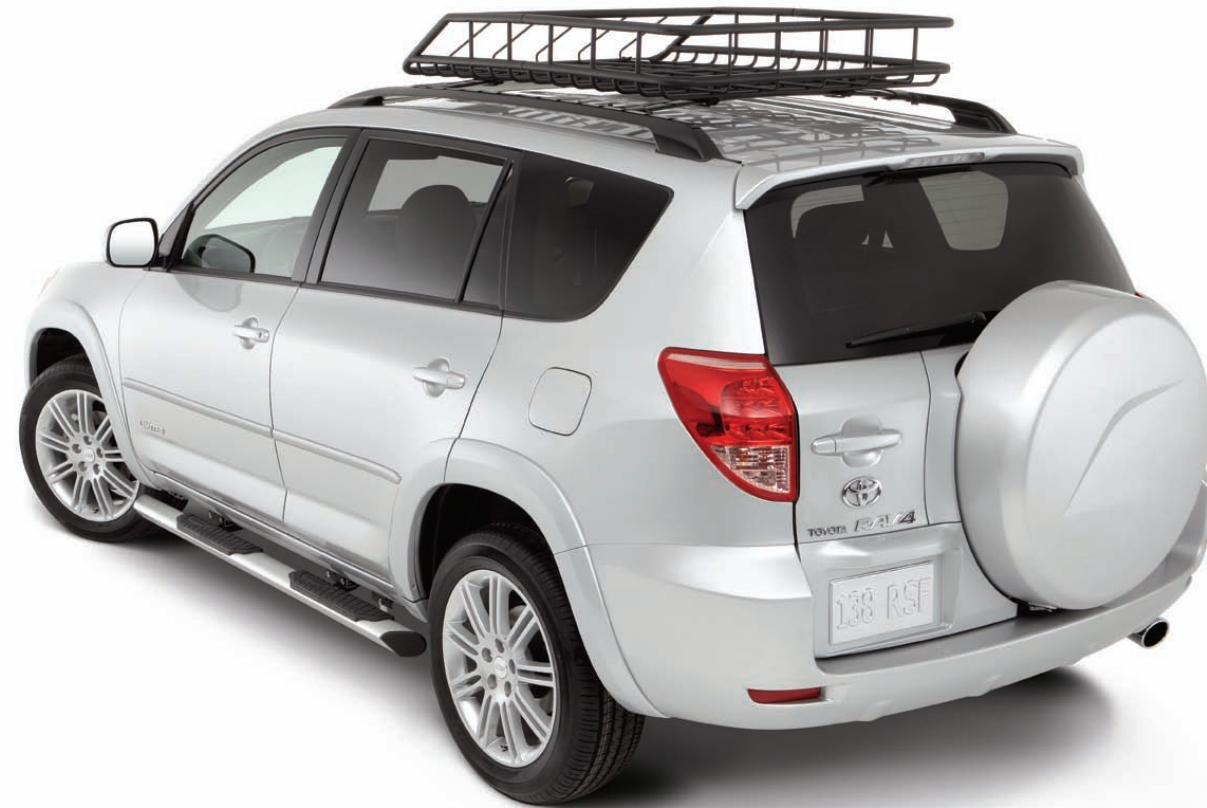
RAV4 ALL DRESSED UP WITH SIDE STEP BARS, BODYSIDE MOULDING, EXHAUST TIP, ALLOY WHEELS, AND EURO RACK (CAGE).