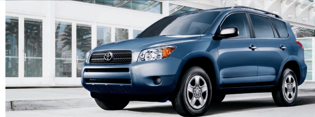
2007 RAV4 MODELS FROM TOP: