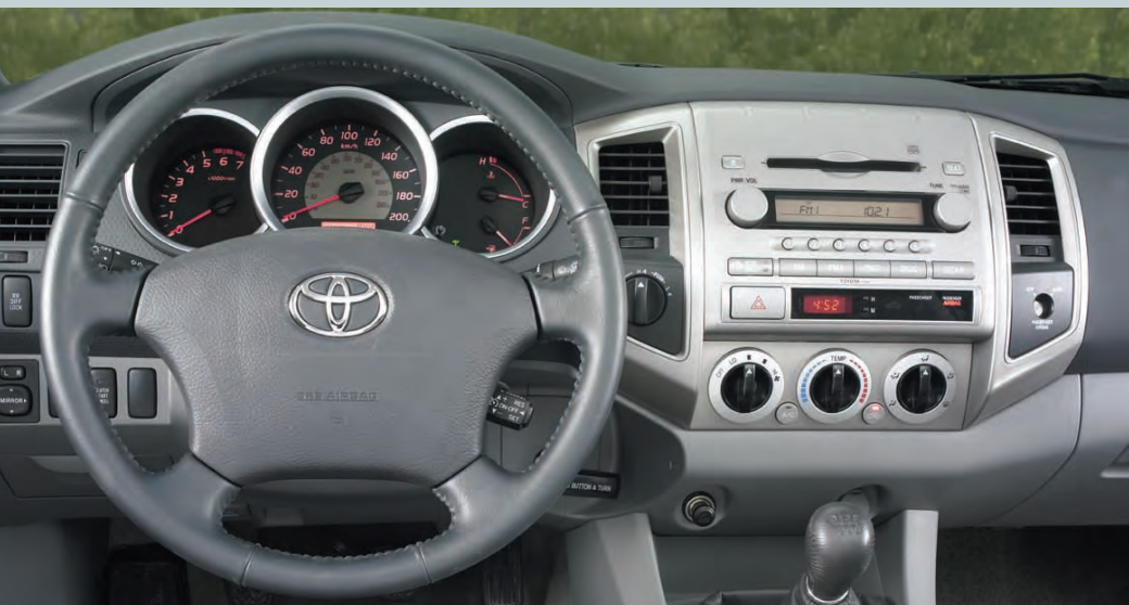
ABOVE TOP: TACOMA ACCESS CAB'S COMFORTABLE AND VERSATILE INTERIOR. ABOVE: TACOMA'S ERGONOMICALLY DESIGNED COCKPIT WITH EVERYTHING AT YOUR FINGERTIPS.