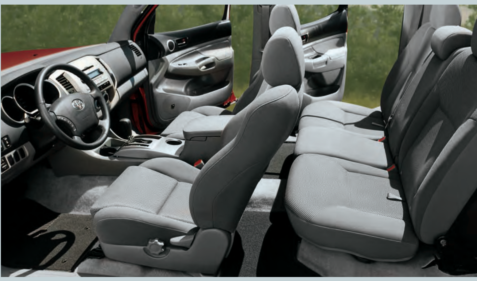
ABOVE: TACOMA DOUBLE CAB'S HUGELY COMFORTABLE INTERIOR.

Tacoma will tackle the challenge at hand — on road or off.