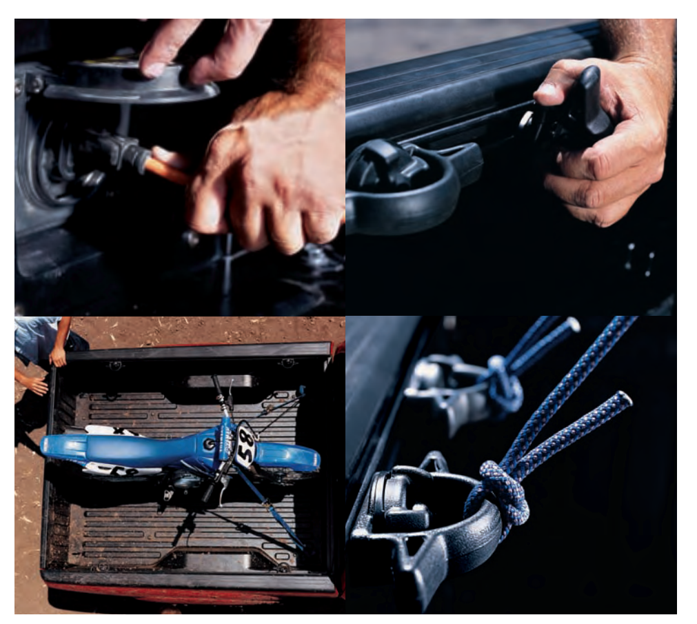
ABOVE TOP: TACOMA'S POWERFUL, 236 HORSEPOWER ENGINE. ABOVE CLOCKWISE FROM LEFT: AN AVAILABLE, AND EVER-SO-USEFUL, 400 WATT CARGO BED POWER OUTLET; TACOMA'S ADJUSTABLE UTILITY RAIL SYSTEM – A FOOLPROOF WAY TO SECURE YOUR CARGO OR YOUR TOYS; TACOMA'S 18" DEEP BOX WITH THE AMAZING FIBER-REINFORCED SHEET-MOULDED COMPOSITE BED THAT HAS BETTER IMPACT-STRENGTH THAN STEEL.

Tacoma offers a 4.0 Litre, V6, DOHC, 24-valve, Variable Valve Timing with intelligence (VVT-i), Sequential Multiport Electronic Fuel Injection engine, that churns out 236 horses and 266 lb.ft. of torque. Not to mention a whole lot of sand and mud. Combined with the TRD Off-Road & Towing Package (optional on 4x4 only), you've got a truck that can get you and your friends wherever you want to go. Horsepower. An underrated anti-depressant.