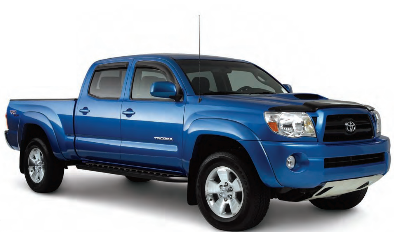
TACOMA ALL DRESSED UP WITH A HOOD DEFLECTOR, RUNNING BOARDS, SKID PLATE AND SIDE WINDOW VISORS.