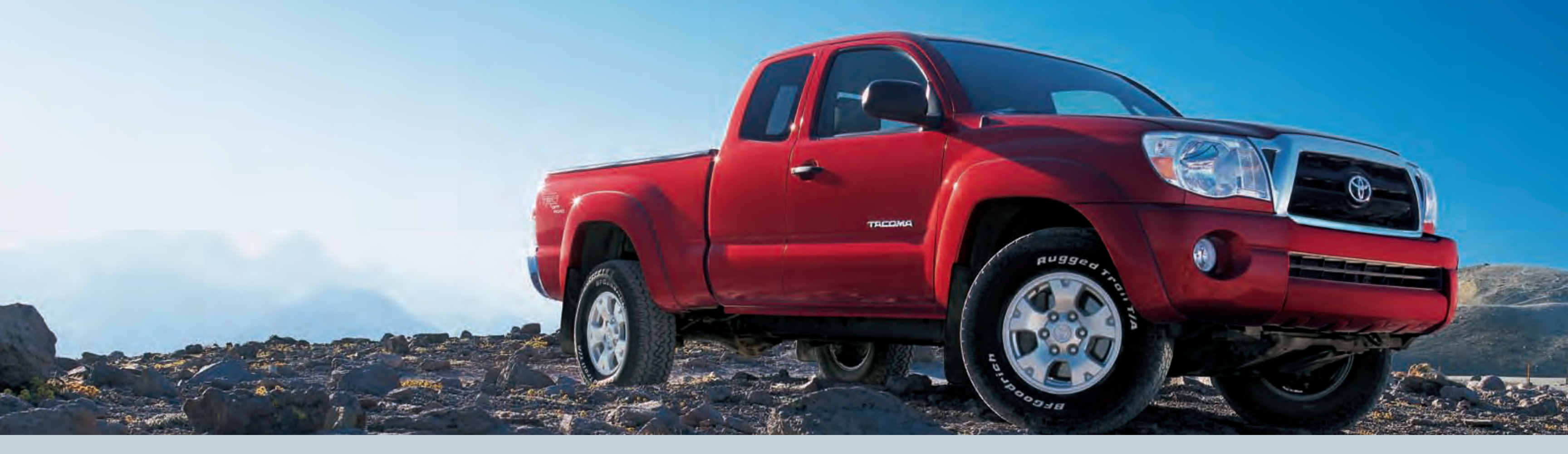
ABOVE: 4X4 TACOMA ACCESS CAB SHOWN IN RADIANT RED WITH OPTIONAL TRD OFF-ROAD & TOWING PACKAGE. BELOW: 4X4 TACOMA DOUBLE CAB SHOWN IN SPEEDWAY BLUE WITH OPTIONAL TRD SPORT & TOWING PACKAGE.