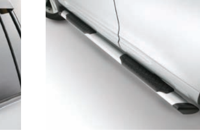
Side Step Bars