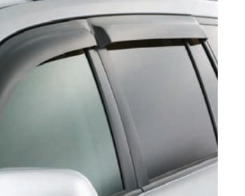
Side Window Visors