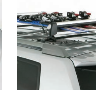
Roof Rack Ski Adapter

ACCESSORIES SHOWN Highlander all dressed up with Roof Rack Ski Adapter, Side Step Bars, Side Window Visors and 2" Swing Away Bike Adapter