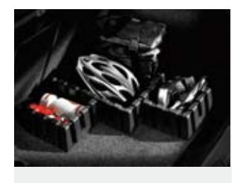
Gorilla Gear Trunk Liner

Put a new spin on your wheels. Goal wheels, Vision V wheels, Karthoum wheels – all designed with customization in mind.