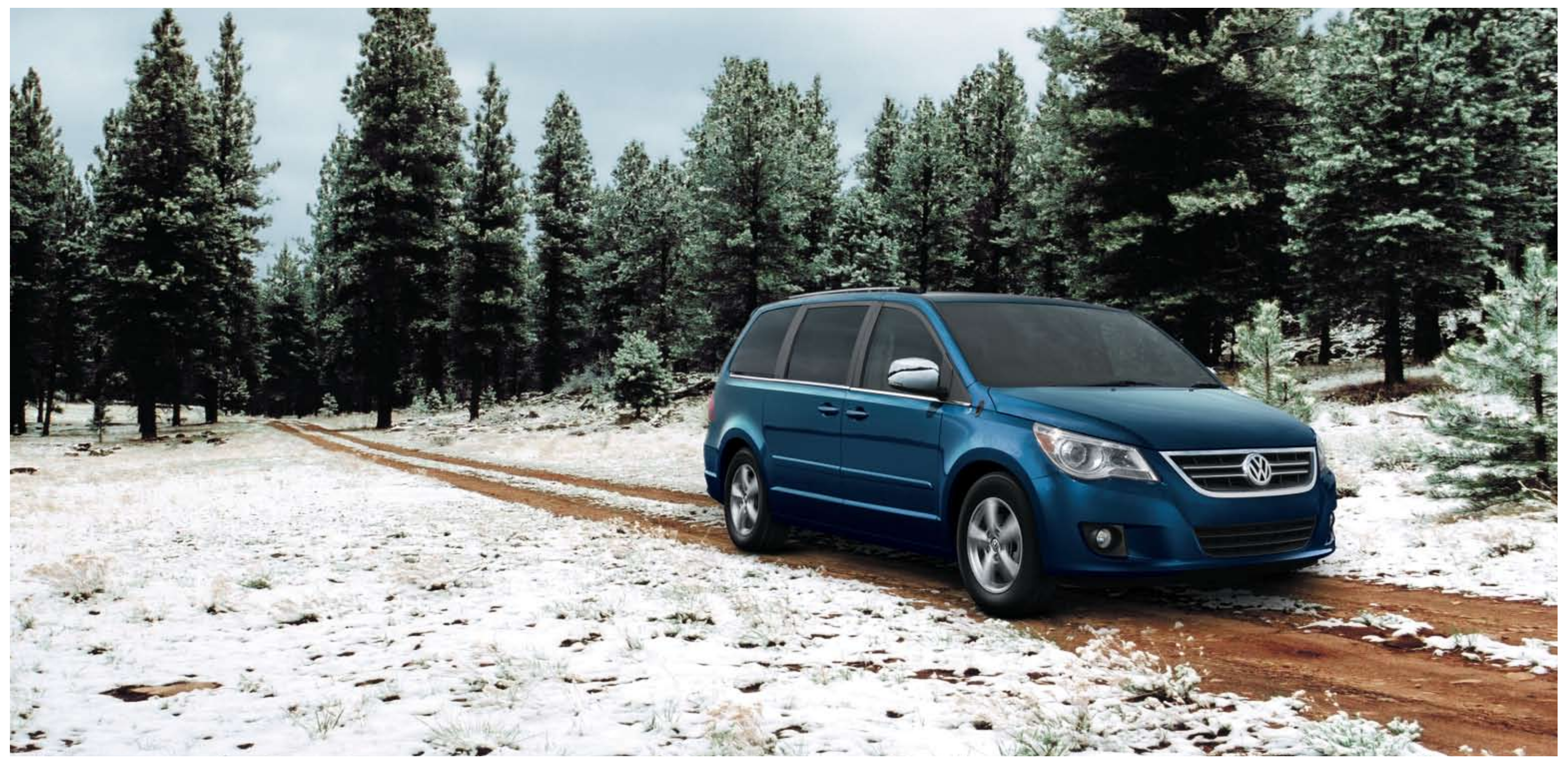
Your vehicle is sold equipped with all-season tires. However, please remember that the use of winter tires may be mandatory in your province or territory. Make sure your vehicle has the proper tires at all times.

The Routan is the newest addition to the Volkswagen family. From its distinctive grille, stylish headlights and eye-catching taillights to its unmistakable VW badging, every precisionengineered detail lives up to its proud Volkswagen heritage. Bring the whole family: the Routan is ready with doors wide open.